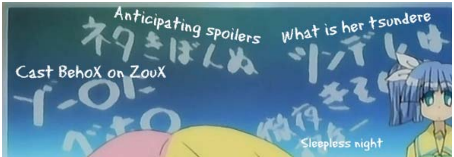
“Anticipating spoilers” Reference to the October 2005 issue of G Fantasy