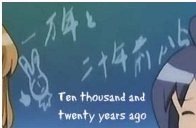
Reference to the lyrics of Sousei no Aquarion's first opening.