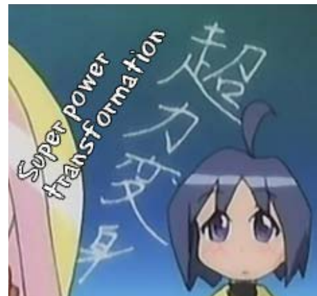
Reference to Super Power Squad O Ranger.