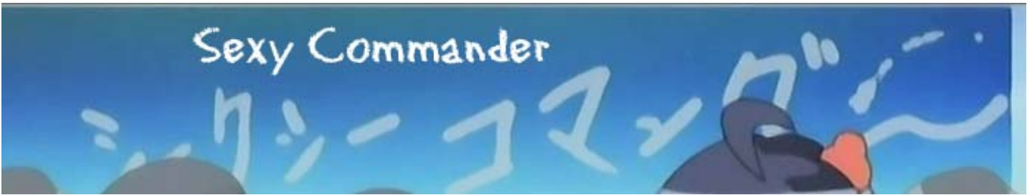
Sexy Commander is a reference to Sexy Commando Gaiden, an anime and manga series.