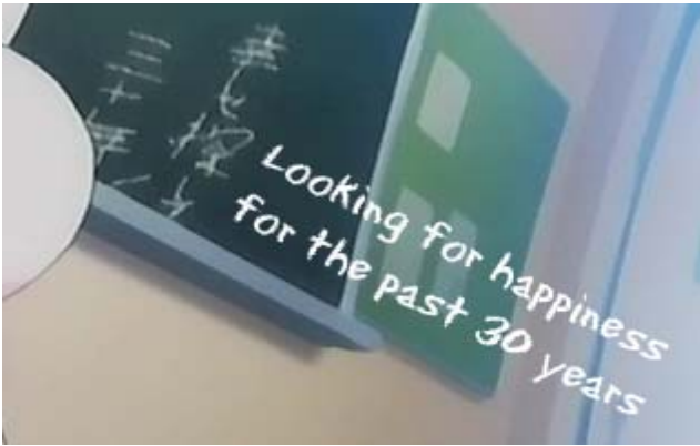
Reference to the manga Kumanopuutarō.