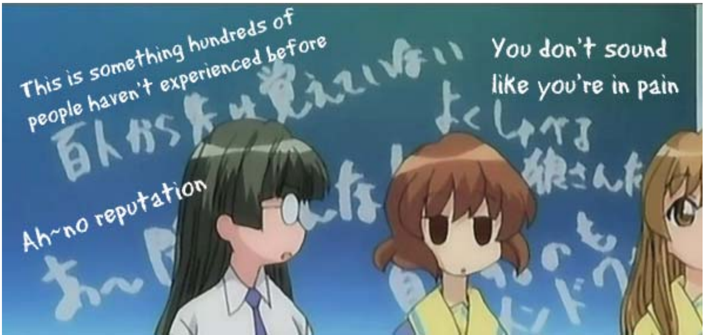
All of these lines are references to Fist of the North Star.