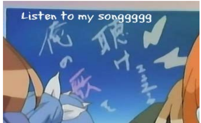
Reference to Macross 7.