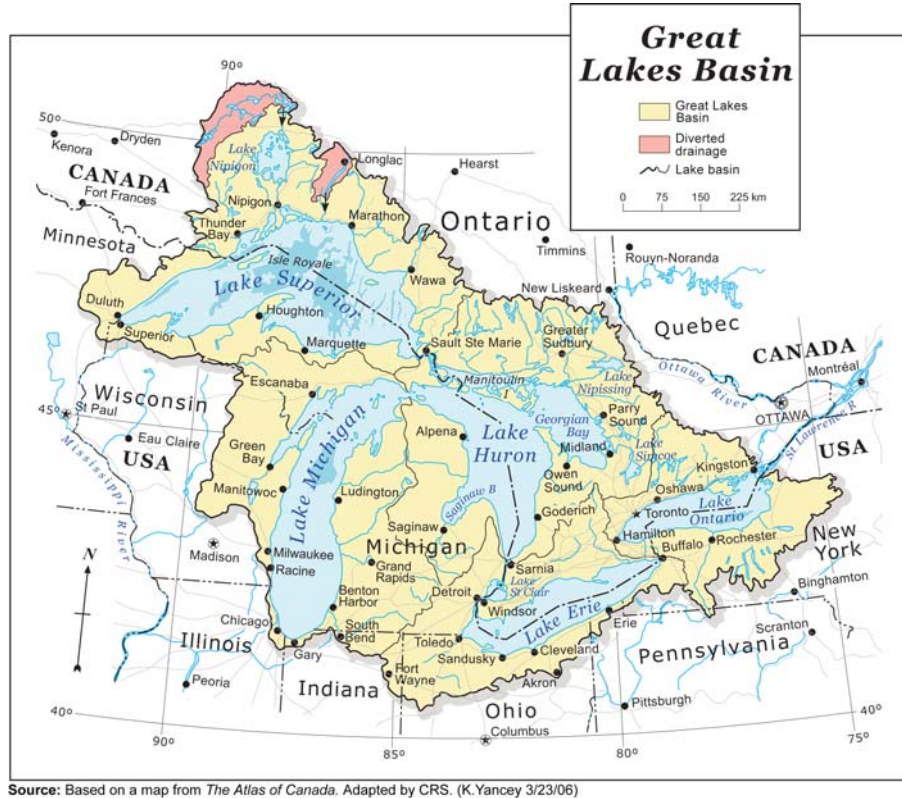
Figure 1. The Great Lakes Basin

Physical Characteristics of the Ecosystem. Since the Great Lakes cover a wide area, physical characteristics such as topography, soils, and climate vary considerably. Characteristics of water flow also vary across the lakes. Water levels in the Great Lakes vary according to the season. These changes are based primarily on precipitation and runoff to the Lakes. Levels are low in the winter, when much of the precipitation is in the form of snow or ice, and high in the early summer, when runoff increases. 9