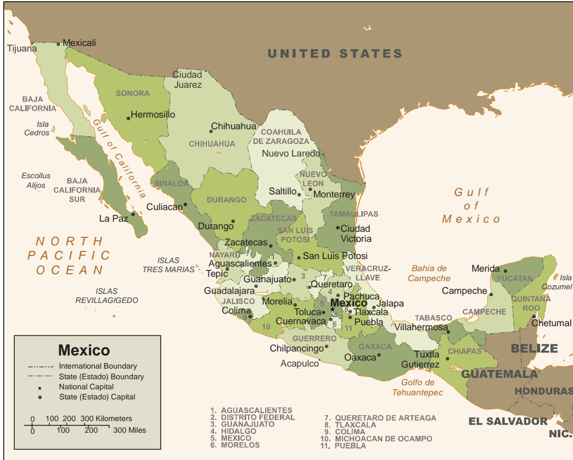
Figure 1. Map of Mexico

Source: Map Resources. Adapted by CRS. (K. Yancey 8/17/06)