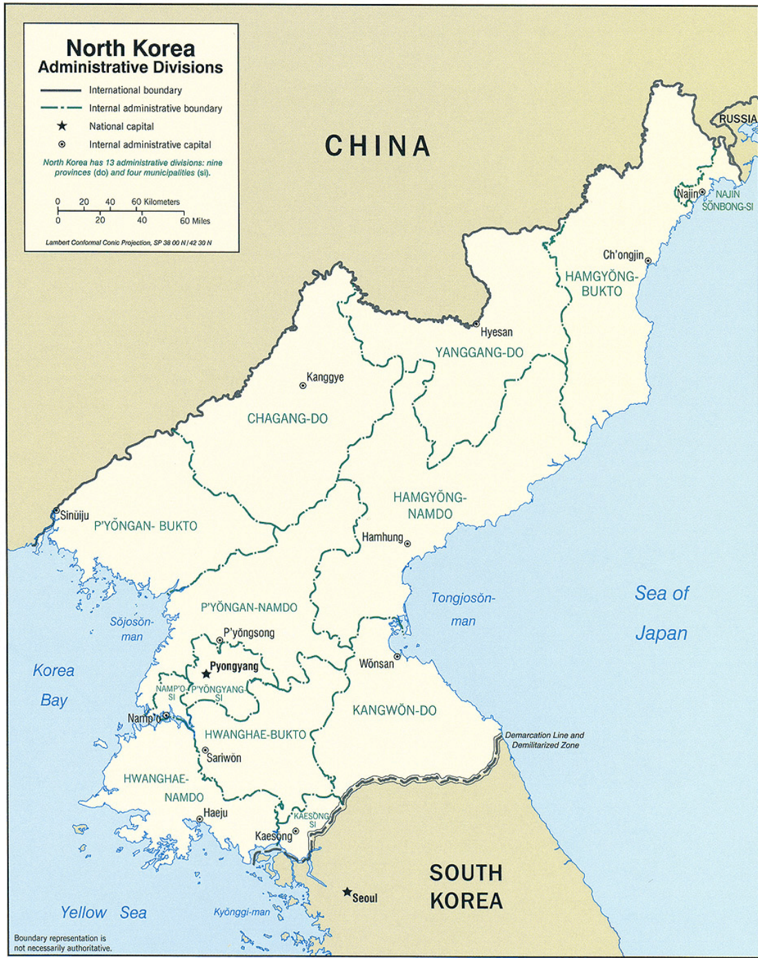
Figure B-2. North Korea: Administrative Divisions (as of 2005)