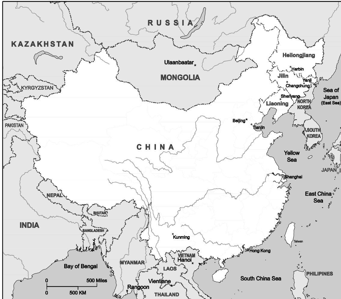
Figure B-1. Regional Perspective on North Korea and China