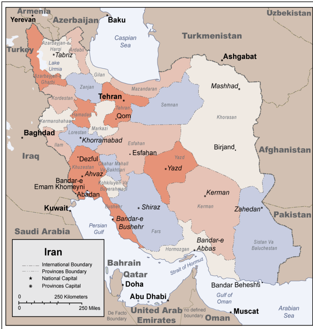
Figure 2. Map of Iran