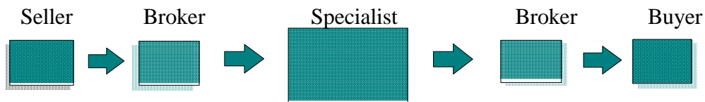
Figure 1. Stock Transactions on the New York Stock Exchange

Most transactions involve the specialist matching a buyer and a seller. On about 10% of trades, however, the specialist acts as a principal. Specialists are expected to step in with their own capital when there is a temporary imbalance of buying and selling interest, to smooth price transitions.