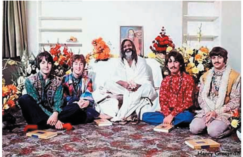
The Beatles with the guru who indirectly influenced the birth of the New Age movement.

4. Books like The Chalice and The Blade , normally consumed by academics, became popular reading. The example of witch persecution was used by feminists to point out what happens when cultures are drastically out of balance. While it may have begun as an historical anecdote, it stirred a curiosity about Witches. We'd been told many lies about politics and religion. It was the best of times in that we were finally free from the shackles of "faith" to openly ask the questions that had smothered our spirits. It was the worst of times because we had to fight the battles in our own homes with our own families. We had no sanctuary and little camaraderie, but we won much for daughters and granddaughters whether they will ever understand that or not.