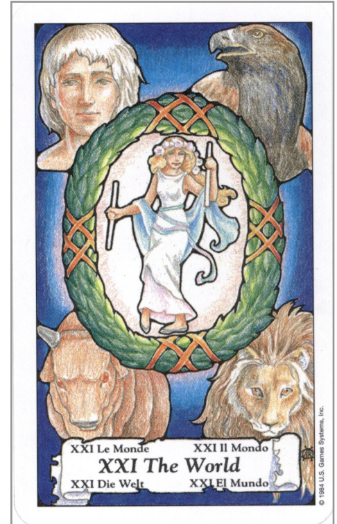
Hanson Roberts Tarot