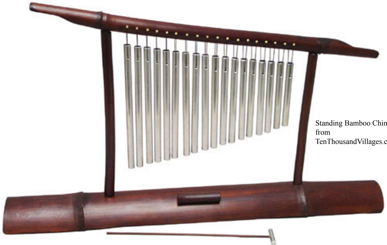
Standing Bamboo Chime from TenThousandVillages.com

AIR – This is the trickiest one because air is difficult to capture. You could use a can of compressed air like the kind you buy for cleaning keyboards, but I recommend something related to air. It could be a wind instrument such as a flute or anything that depends upon air such as a balloon, kite, windsock or wind chime. I use a Chinese table chime similar to the one pictured below. The chimes are delicate enough to respond to your breath -- the element of Air (and life) generated in you, by you.