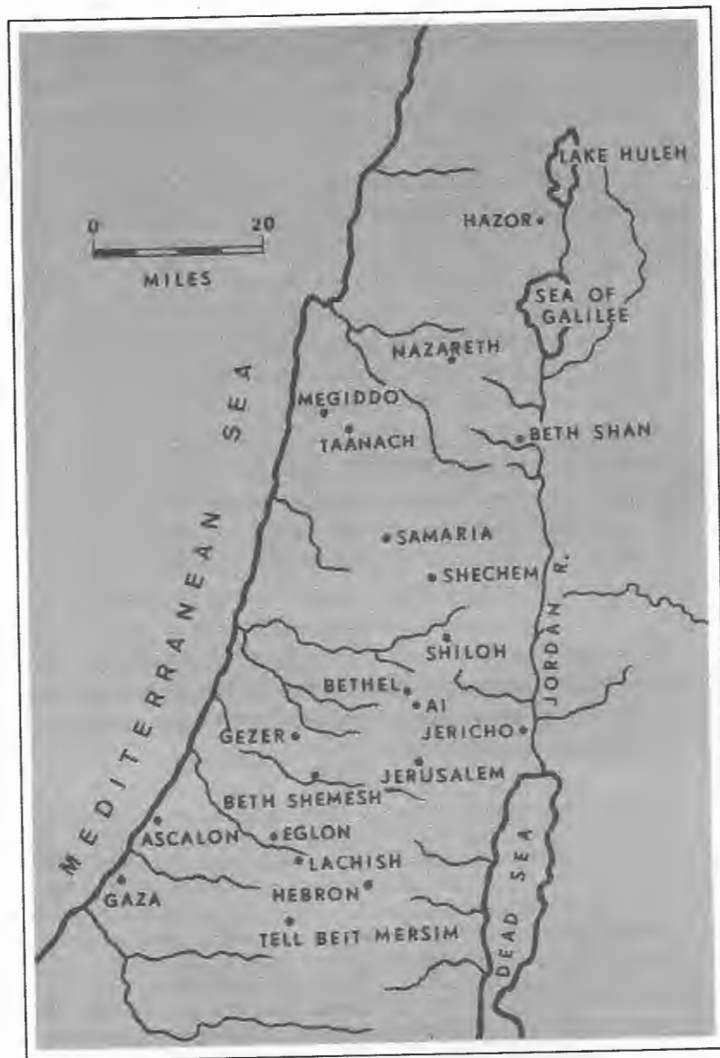
Map 4 Southern Canaan—Old Testament