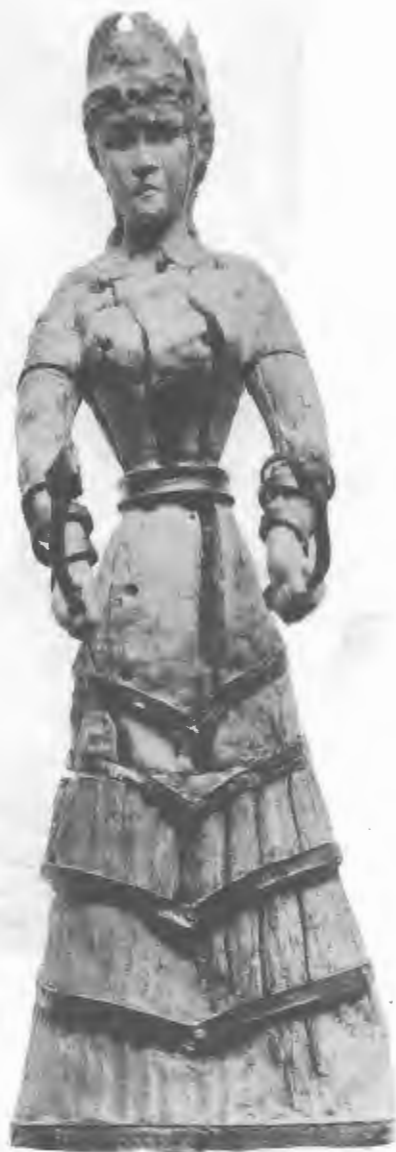
6 A & B Two gold serpents coil about the arms and extend from the hands of this delicately carved ivory and gold Goddess or priestess from seventeenth-century B.C. Crete. Courtesy Museum of Fine Arts, Boston. Gift of Mrs. W. Scott Fitz.