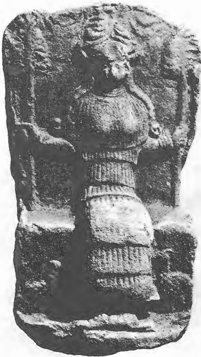
7 One of the many portrayals of the Sumerian Goddess seated upon her throne. This piece was found in a level of the Early Dynastic Period (early third millennium) of the city of Ur in Sumer (Iraq).