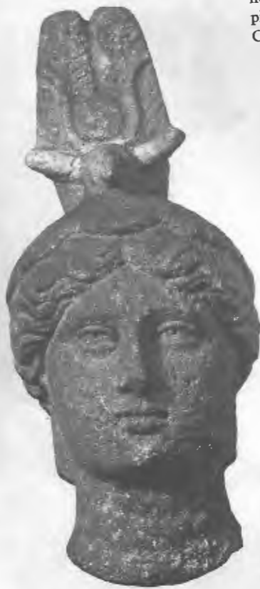
12 Greek period statue of the Lady of Byblos (Baalat) from Byblos, Canaan (Lebanon). The worship of the Goddess at the temple of Byblos dates back to at least 2800 B.C. and was closely associated with the worship of Isis and Hathor of Egypt as well as that of The Serpent Lady of the Sinai Peninsula.