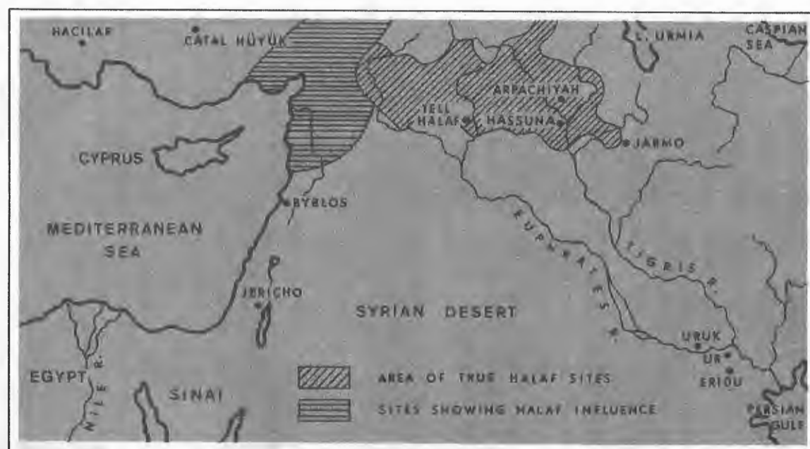
Map 1 Some Neolithic and Chalcolithic settlements 7000-4000 BC