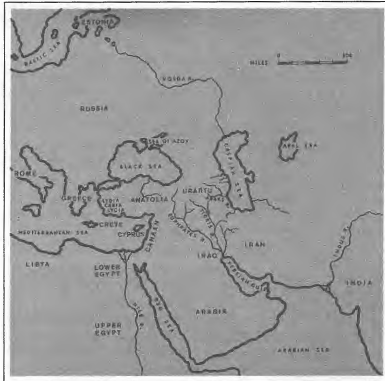
Map 3 Some major waterways from Estonia to the Persian Gulf

times. These boats were basically logs with holes burned out for the occupants. In earlier periods these people were located in northern Europe and Denmark. Two canoes, one in the Netherlands and one on the coast of Scotland, have both been attributed to the Maglemosian people. Maglemosian steering paddles, fish nets and fishing traps reveal that these boats were used for fishing activities, apparently a major aspect of Maglemosian life.*