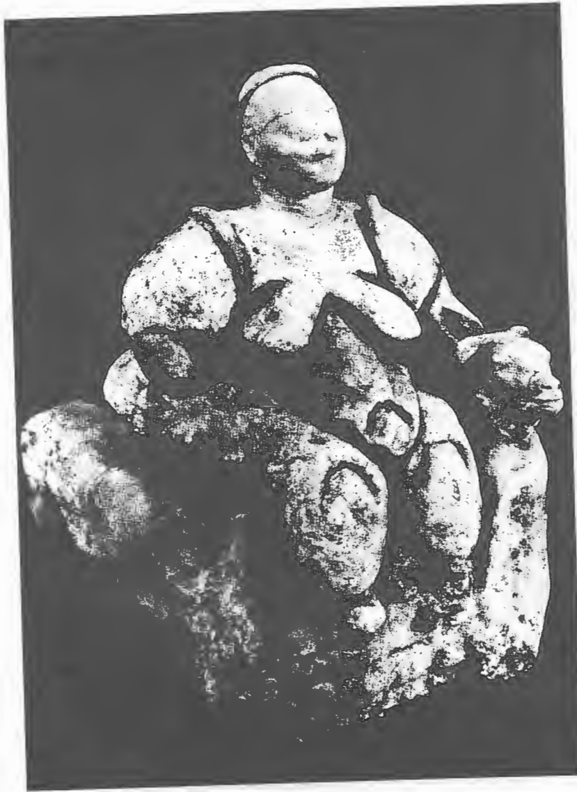
4 Goddess seated upon double feline throne. Discovered in Level II (5750 B.C.) of Catal Hüyük, Anatolia (Turkey), by James Mellaart, who unearthed many other Goddess figures and ancient shrines at the same site.