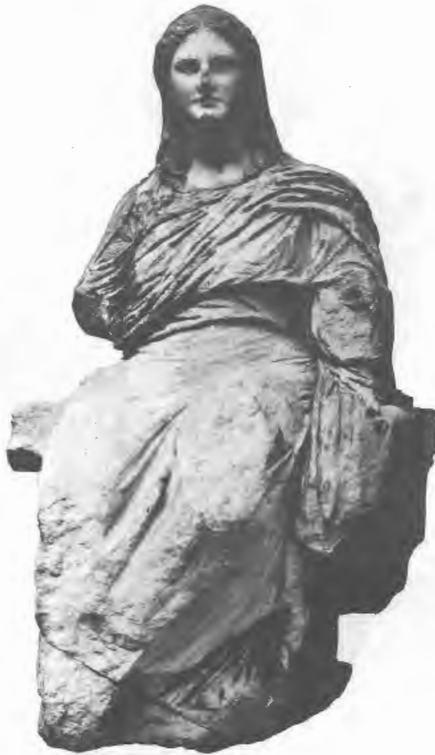
17 A larger-than-life-size statue of the Greek Goddess Demeter, worshiped as the provider of law and agriculture, whose most important center was at Eleusis. This portrayal of the Goddess of the Eleusinian Mysteries comes from Cnidus, Turkey (ancient Caria).