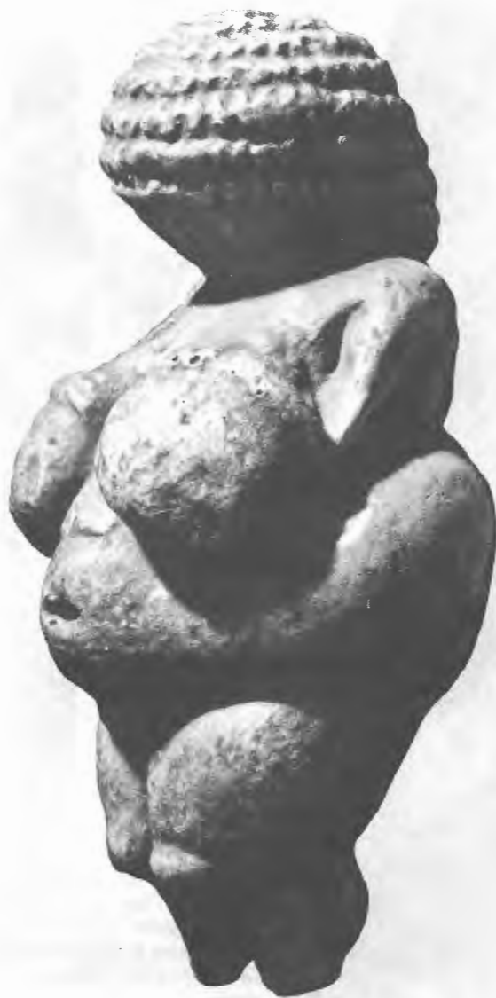
1 Cast of Upper Paleolithic Venus figure (about 25,000 B.C.) from Willendorf, Austria. This is one of numerous similar figures discovered in the Gravettian-Aurignacian sites that range across Europe and Asia, from Spain to Russia.