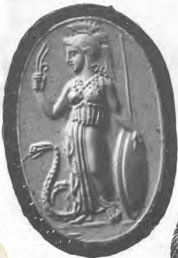
18 Seal stone of the Goddess Athena, whose major site of worship was the Acropolis of Athens, Greece. As in many other portrayals of Athena, she is depicted here with her sacred serpent. This small carving in carnelian was found in Curium, Cyprus, and is dated to the fifth century B.C.