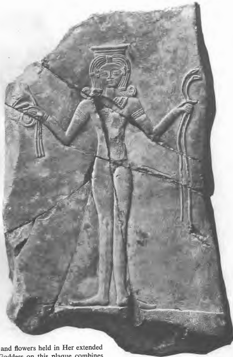
8 Serpents and flowers held in Her extended arms, the Goddess on this plaque combines the symbolism of the Egyptian Goddess Hathor and the Canaanite Goddess Ashtoreth. Similar "Astarte plaques" have been discovered in Egypt, Lebanon, Israel, Jordan and Iraq. This one from Egypt is dated at about 1250 B.C.