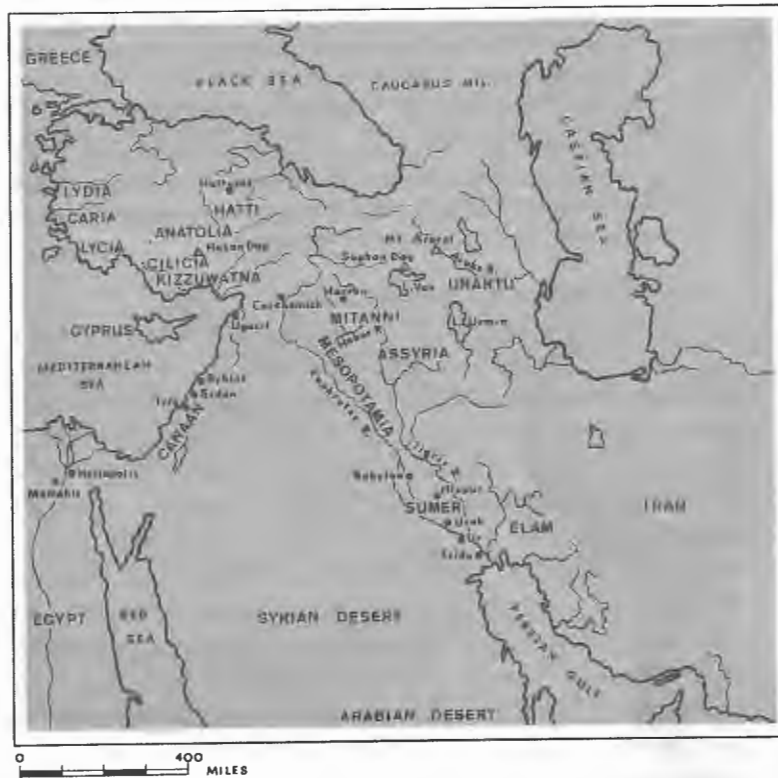
Map 2 Location of areas discussed in chapter 4

lenium BC revolutionized the art of war. The newcomers introduced the horse-drawn war chariot, which gave a swift striking power hitherto unknown in the Near East . . . The elite charioteer officers, who bear the Indo-European name of maryannu , soon became a new aristocracy throughout the entire area including Egypt.”