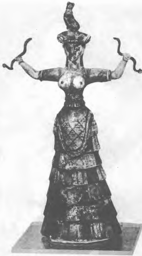
5 Still known to the Cretans as The Little Goddess of the Serpents, this portrait of the Goddess or one of her priestesses was discovered in the Palace of Knossos on Crete. The figure is dated to the Middle Minoan Period (2000–1800 B.C.).