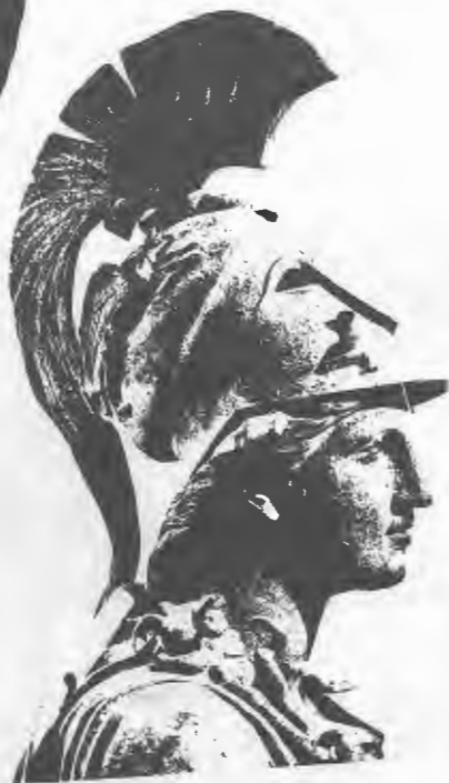
19 Large bronze head of Athena in her battle helmet. Serpents adorn her shoulders and breastplate. Found in Piraeus, Greece, this portrayal of the patron deity of Athens is dated to the fourth century B.C.