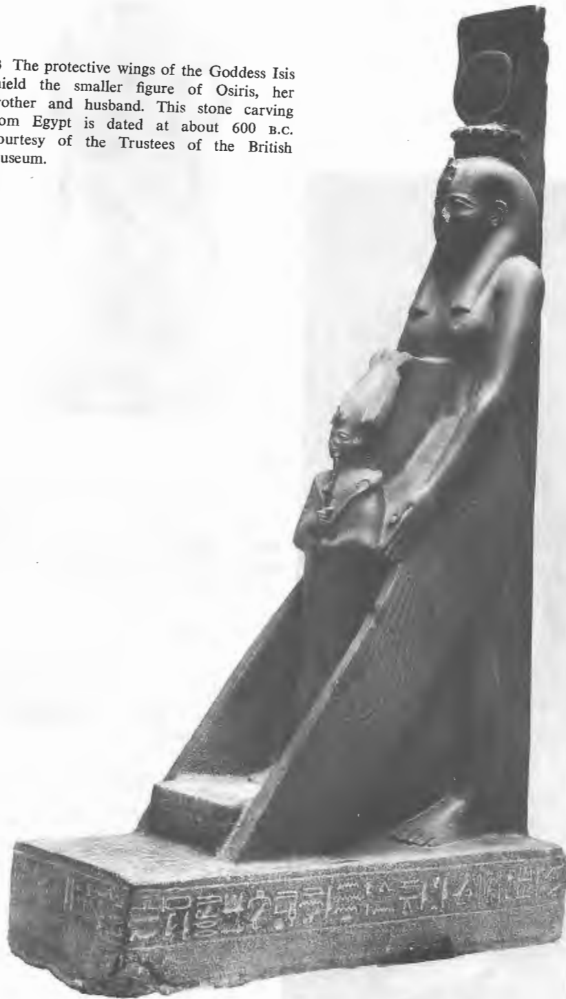
13 The protective wings of the Goddess Isis shield the smaller figure of Osiris, her brother and husband. This stone carving from Egypt is dated at about 600 B.C.