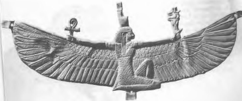
11 A gold pectoral of the winged Isis wearing the Egyptian symbol of the throne upon her head. Discovered in a pyramid in Ethiopia, this piece is dated at about 600 B.C.