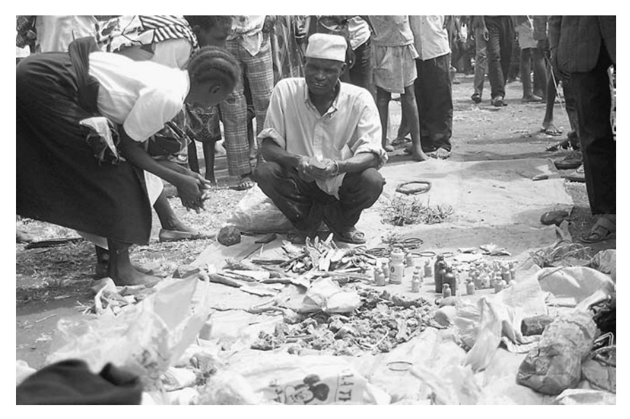
Figure 8.1 A diviner from Tabora District, western Tanzania, practising his trade at a travelling martket ( mnada ) in Ihanzu, June 1994.

list of illnesses and symptoms he claims to treat, and some of the medicines on offer. To take just a few: (1) epilepsy; (3) shooting pains; (11) swollen feet; (19) love medicine; (29) bloody nose; (30) fertility medicine; (33) skin disease; and (34) dizziness. Also on offer are: (20) medicine to protect individuals against witchcraft; (21) business medicine; (47) medicine to protect a home against witchcraft; (55) removal (lit. 'shaving') of witchcraft; and (58) medicine to raise the dead. Clearly, with the 'free' market, marketing the occult has become big business.