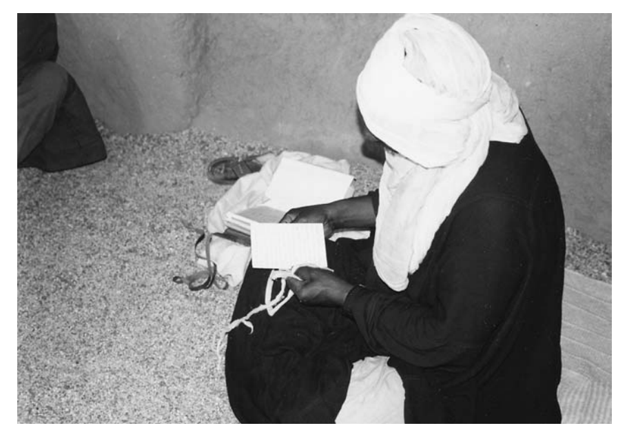
Figure 7.2 A marabout man working with verses which he will insert into an amulet.

As guardians of sacred places in times of economic and ecological crisis, some marabouts take a stand against what they view as dubious benefits of central state edicts, international aid programmes, and tourism agencies intruding into Air. Following Niger's independence, during difficult years of drought, some marabouts' powers to bring rain were marshalled, but also threatened. When an aid agency installed rain gauges one rainy season on the plateau summit of Mount Bagzan, the rains did not fall as expected. Local marabouts insisted that it was these rain gauges that were causing the drought, by preventing the rain from falling. This veiled their fear of some political competition of outside influences from these postcolonial central state authorities, in the form of technical aid. There was a conflict of modernities here: in effect, the marabouts sensed the competition for technological control, and possibly also for political power from the aid agency, despite the general welcoming of some of its benefits.