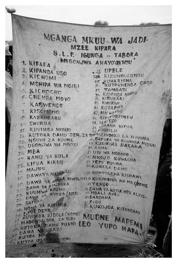
Figure 8.2 The Tabora diviner's make-shift, cloth banner which lists some of the symptoms he treats and the medicines available for sale, including medicine to get rich in business, to protect one's self and home against witchcraft and to raise the dead ( dawa ya kuita mfu alive ).

the nation has come the democratization of the occult. Through the allpervasive 'free' market, anyone who can afford it now has instant access to occult forces. Note, the logic here goes beyond just 'new market access', to explore the depths of the market's apparent operation.