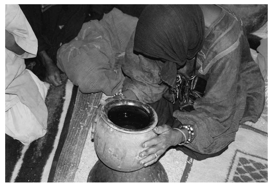
Figure 7.1 Herbal medicine woman divining to diagnose tezma -induced illness.