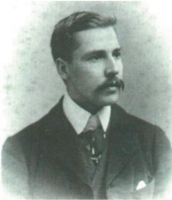
Arthur Edward Waite 1857-1943

Waite was born in Brooklyn, but moved to England with his family as a one-year-old. He studied with every school of magick, famous and infamous, and made great contributions to Freemasonry (and by default modern witchcraft) even though they do not give him the credit and recognition he deserves. His lasting legacy for Witches and Magicians is the Rider-Waite Tarot, widely considered to be the standard for tarot.