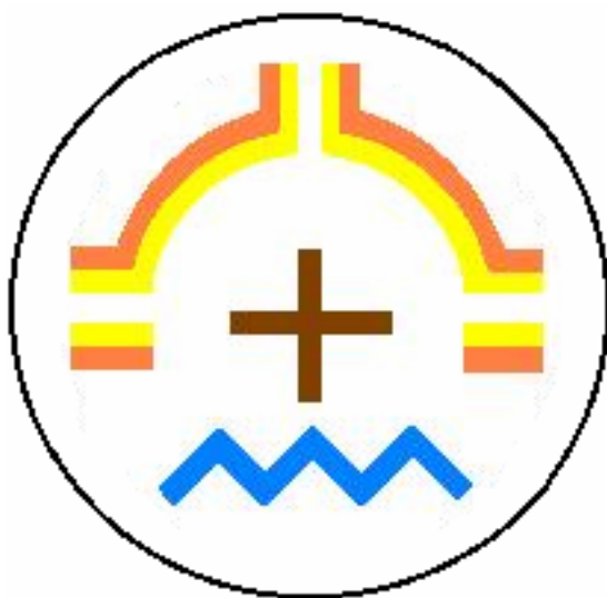
The Correllium, symbol of the Correllian Tradition showing the vault of heaven with a double line representing Air and Light (Fire), the cross of the Four Directions representing Earth, and a wave representing Water. The whole represents the Unity of Existence.

We stress the importance of the Pagan Clergy as teachers and facilitators, and the need for a strong public presence. The Correllian Tradition emphasizes celebratory as well as initiatory Wicca, and is strongly committed to accessible public ritual.