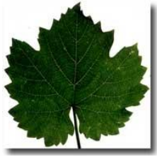
Vine - The Equalizer

Vine signs are born within the autumnal equinox, which makes your personality changeable and unpredictable. You can be full of contradictions, and are often indecisive. But this is because you can see both sides of the story, and empathize with each equally. It is hard for you to pick sides because you can see the good points on each end. There are, however, areas in your life that you are quite sure about. These include the finer things of life like food, wine, music, and art. You have very distinctive taste, and are a connoisseur of refinement . Luxury agrees with you, and under good conditions you have a Midas touch for turning drab into dramatic beauty. You are charming, elegant, and maintain a level of class that wins you esteem from a large fan base. Indeed, you often find yourself in public places where others can admire your classic style and poise. Vine signs pair well with Willow and Hazel signs.