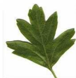
Hawthorn - The Illusionist

If you are a Willow sign, you are ruled by the moon, and so your personality holds hands with many of the mystical aspects of the lunar realm. This means you are highly creative, intuitive ( highly psychic people are born under the sign of the Willow) and intelligent. You have a keen understanding of cycles, and you inherently know that every situation has a season. This gives you a realistic perspective of things, and also causes you to be more patient than most tree signs. With your intelligence comes a natural ability to retain knowledge and you often impress your company with the ability to expound on subjects from memory. Willow Celtic tree astrology signs are bursting with potential , but have a tendency to hold themselves back for fear of appearing flamboyant or overindulgent. It is your powers of perception that ultimately allow your true nature to shine, and what leads you to success in life. Willow signs join well with the Birch and the Ivy.