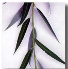
Willow - The Observer

If you are an Alder sign within the Celtic tree astrology system, you are a natural-born pathfinder. You're a mover and a shaker, and will blaze a trail with fiery passion often gaining loyal followers to your cause. You are charming, gregarious and mingle easily with a broad mix of personalities. In other words, Alder signs get along with everybody and everybody loves to hang around with you. This might be because Alder's are easily confident and have a strong self-faith. This self-assurance is infectious and other people recognize this quality in you instantly. Alder Celtic tree astrology signs are very focused and dislike waste . Consequently, they can see through superficialities and will not tolerate fluff. Alder people place high value on their time, and feel that wasting time is insufferable. They are motivated by action and results. Alder's pair well with Hawthorns, Oaks or even Birch signs.