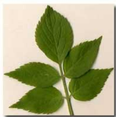
Elder - The Seeker

Elder archetypes among Celtic tree astrology tend to be freedom-loving, and sometimes appear to be a bit wild to the other signs of the zodiac. In younger years you may have lived life in the fast lane , often identified as a “thrill seeker.” At the time of your birth the light of the sun was fast fleeting and so you take the same cue from nature. You are often misjudged as an outsider as you have a tendency to be withdrawn in spite of your extroverted nature. In actuality, you are deeply thoughtful with philosophical bent. You also tend to be very considerate of others and genuinely strive to be helpful. These acts of assistance are sometimes thwarted by your brutal honesty (which you openly share solicited or otherwise). Elder Celtic tree astrology signs fit well with Alder’s and Holly’s.