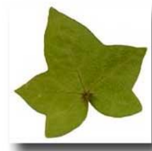
Ivy - The Survivor

Vine signs are born within the autumnal equinox, which makes your personality changeable and unpredictable. You can be full of contradictions, and are often indecisive. But this is because you can see both sides of the story, and empathize with each equally. It is hard for you to pick sides because you can see the good points on each end. There are, however, areas in your life that you are quite sure about. These include the finer things of life like food, wine, music, and art. You have very distinctive taste, and are a connoisseur of refinement . Luxury agrees with you, and under good conditions you have a Midas touch for turning drab into dramatic beauty. You are charming, elegant, and maintain a level of class that wins you esteem from a large fan base. Indeed, you often find yourself in public places where others can admire your classic style and poise. Vine signs pair well with Willow and Hazel signs.