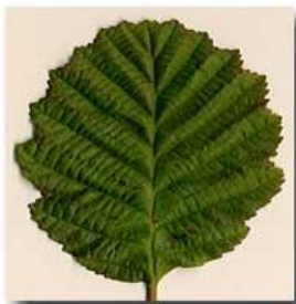
Alder - The Trailblazer