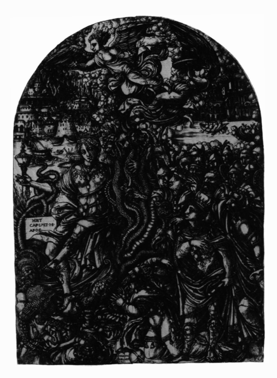
Jean Duvet Apocalypse, Revelations 17-18,