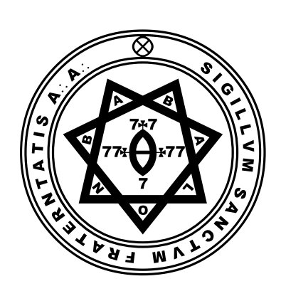
A∴A∴ Publication in Class D