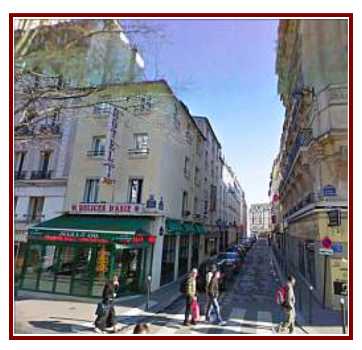
September, 1924 Leah, deserted by Crowley, finds room 44 at this hotel, at 64 Avenue du Maine, Paris.