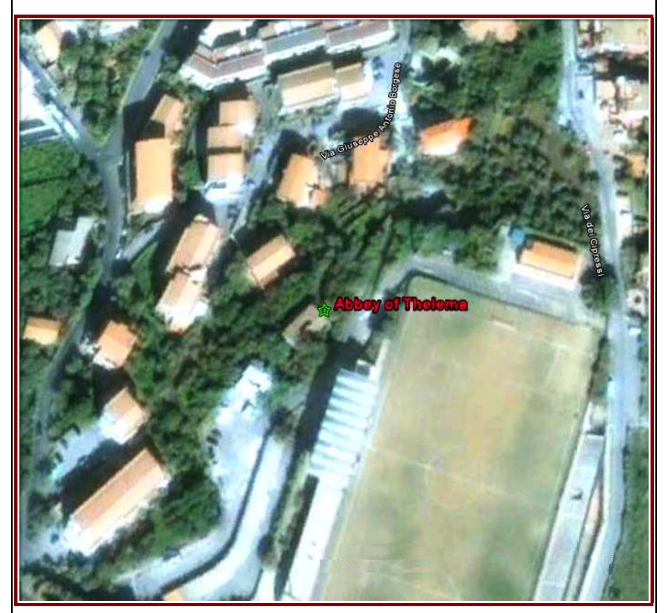
An overhead view of the Abbey of Thelema, commonly known as the Villa Santa Barbara, Cefalu.