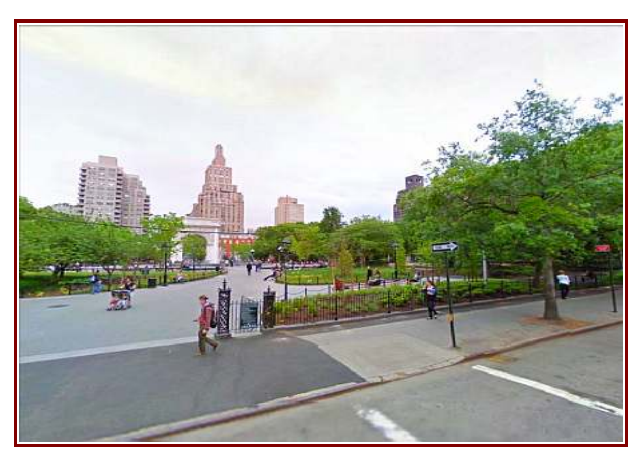
The view across from 60 Washington Square S., N.Y.