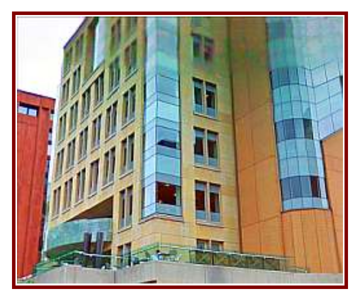
A closer view of 60 Washington Square S., N.Y.