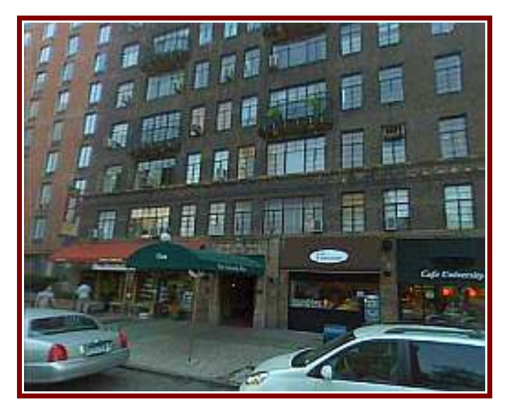
Another view of 1 University Place, New York.