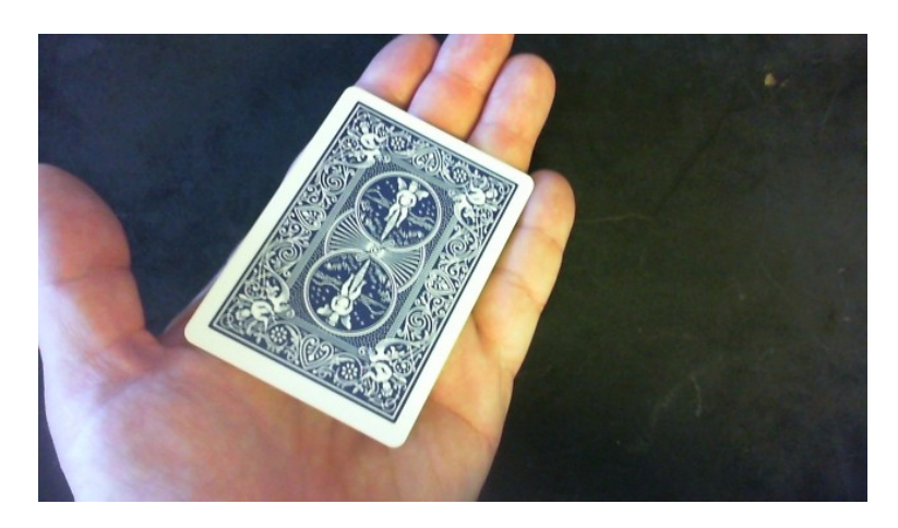
The first card is their past.

When I do walk around, and I do not have a table all I do is have them hold their hand out palm upwards. I then use their palm as a little table. In the case I put one card down at a time on their palm.