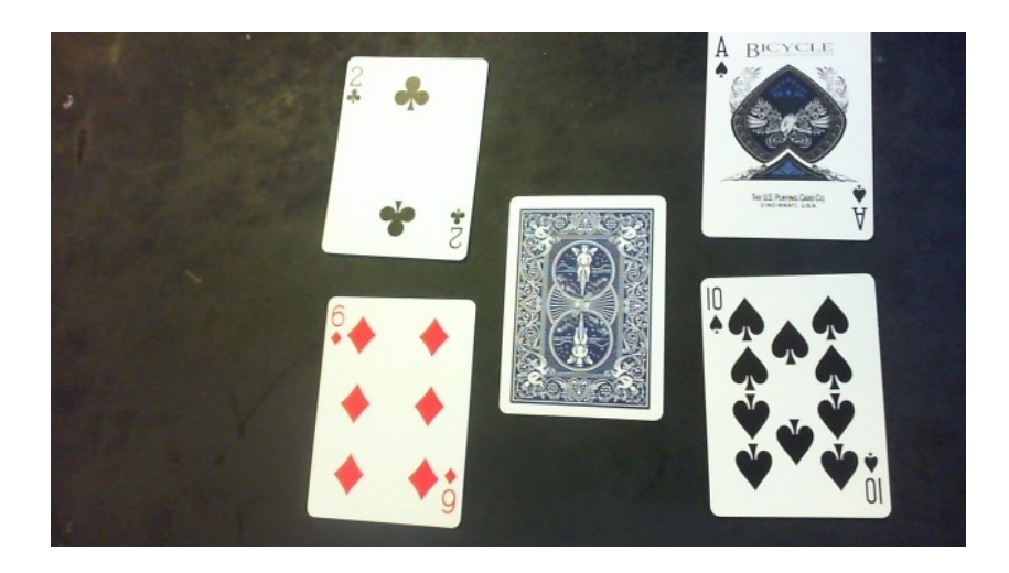
I then turn that card over to see where their relationship is going.

The reading does not stop there. If I have a table I then drop the next card in the middle of the spread and this card represents the future of their relationship.