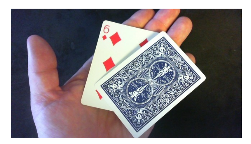
I place the card face down in their hand, square up the deck, and then turn it over.

I will then turn it over and read that card. I will then add the second card to the reading and this is their present card.