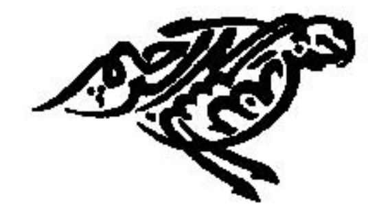
We shall show them Our signs in the Horizons and in themselves. . . By the morning light!' The Sun