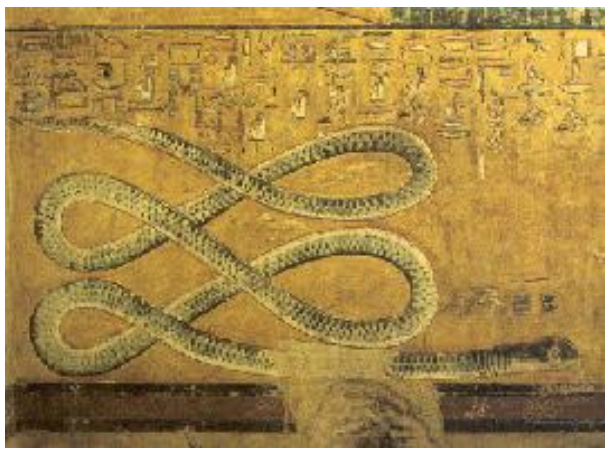
Ancient Egypt: Apep

"Aker", was a dragon representing the Earth. It bound the coils of Apep. It was believed to preside over the point where the eastern and western horizons of the Underworld met. Aker aids the forces of light by binding and chaining the serpent when Ra passes through the underworld.