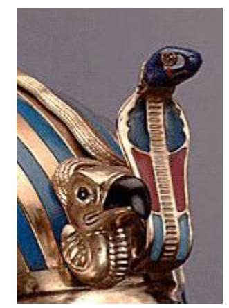
The Uraeus from Civilization.ca

- Ouroboros is a "tail eater" dragon who constantly holds its tail in its mouth. First discovered in Egypt as early as 1600 BC, Egyptians worshipped Ouroboros, as Sata, (Satan) or "Tuat", on whose back the sun god rose through the underworld each night. In Greece, it is the symbol of the universe and eternity. The serpent devouring its own tail to sustain its life is an eternal cycle of renewal, symbolising the cyclic Nature of the Universe - that creation comes forth of destruction, and life out of death. The serpent biting its tail is found in other mythological cultures as well, including Norse myth, where the serpent's name is Jormungand.