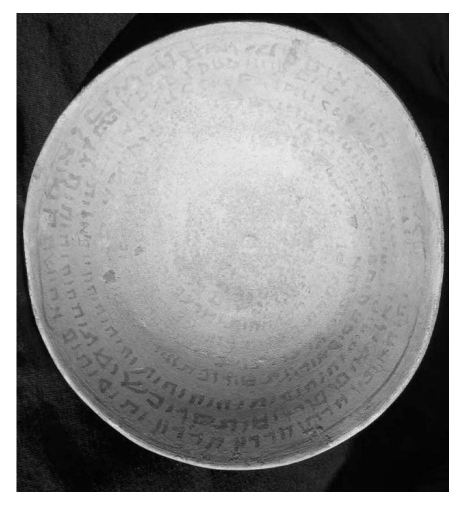
Figure 4 Jewish Aramaic magic bowl (unpublished: private collection).