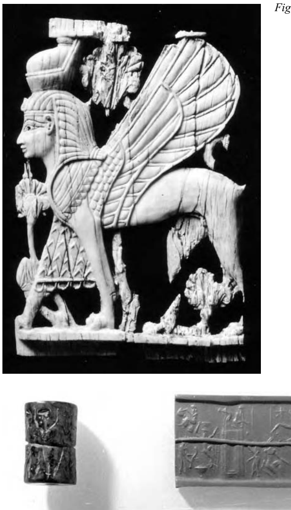
Figure 6 Ivory inlay: Cherub or winged sphinx, Phoenician style, Arslan Tash, Syria, c.850–800 BCE (Courtesy of the Bible Lands Museum Jerusalem) (photo credit: David Harris).