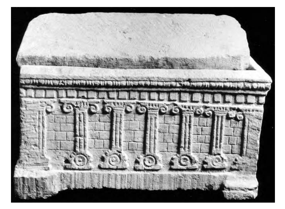
Figure 5 Ossuary with lid. Second Temple period, Israel, c . CE 1–100 (courtesy of the Bible Lands Museum Jerusalem.) (photo credit: Zev Radovan).