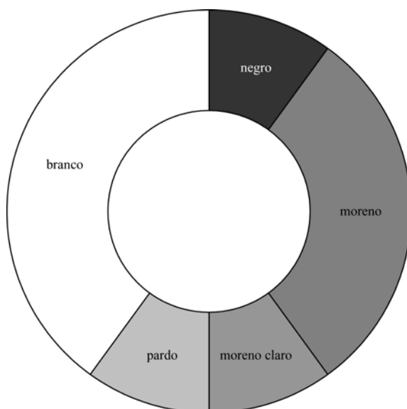
FIGURE 2.1. Breakdown of Color Descriptor Categories and Their Representation among Members

A more systematic study is needed to investigate the correspondence between participants' color categories and racial categories, and how the criteria upon which the color descriptor terms are allocated, intersect and overlap with, or diverge from, what it means to identify oneself as "afro." In the quotation opening this chapter, the mãe-de-santo identifies herself as Afro. More specifically, the "nation" within which she holds membership is Angola. This is by virtue of her initiation into Angolan Candomblé, however, and does not connote (biological) race as it is normally understood and as she is likely to define it for a general census. In terms of color this mãe would be described as white, but she is one of the Black Movement's ( Movimento Negro ) keenest supporters, and, along with all culto afro filhos and filhas , is included as a member by virtue of her cultural and religious heritage. Determining the precise breakdown of these categories, then, and their representation within the terreiro requires systematic investigation of the criteria by which each individual describes and defines his or her color, religious nationality and race, and how that individual's choice of identity label is influenced by the immediate social context. Furthermore, it may not necessarily be immediately obvious whether color or race categories are being appealed to in the descriptions as labels are not