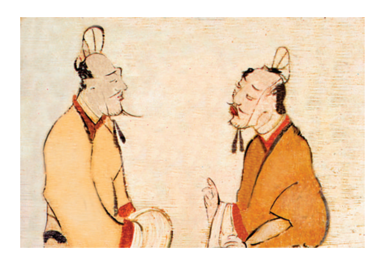
The Enlightenment Technique

The core of the Enlightenment Intensive is contained in the Enlightenment Technique. Understanding the technique makes it possible to conduct an Enlightenment Intensive properly. There is a lot to understand. You should aim for a complete understanding of how the technique works so that you can see why it is constructed the way it is. If you do not understand it all, you will not appreciate the great truth and power that is contained in it and you will be tempted to vary it, thinking that one way is as good as the other. You will drift away from the exact technique, as many people have, with the result that the power of it will weaken and weaken and you will end up with some ordinary activity.