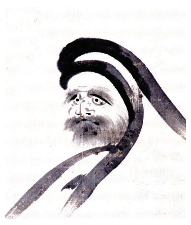
Who am I?

Koans, or key questions, came into being in Rinzai Zen when one master thought it would be useful to limit and specify which aspect of Truth one was intending to consciously, directly know. In India, both in ancient times and modern times, seekers of Truth have pondered the question, 'Who am I?' which also focuses the attention. There are different schools of thought as to whether or not one's attention should be focused and it depends partly on one's purpose. Our purpose is to give the participants on an Enlightenment Intensive an opportunity for an enlightenment experience in three days, so we provide a question which they can use to come into contact with the specific object of their enlightenment. This speeds up the process. However, the question is only a tool. It is not the object of enlightenment. It is a device to help bring the participant closer to his object of enlightenment by aiming him toward it. As a master it is important that you not lead the participants into thinking they are working on answering a question because they are not. They are working on having conscious, direct knowledge of the object of their enlightenment and the question is a tool to help them accomplish this.