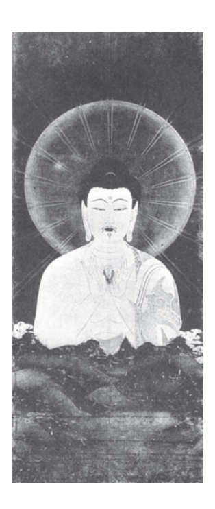
Enlightenment is a conscious state of direct knowledge of yourself as you truly are.