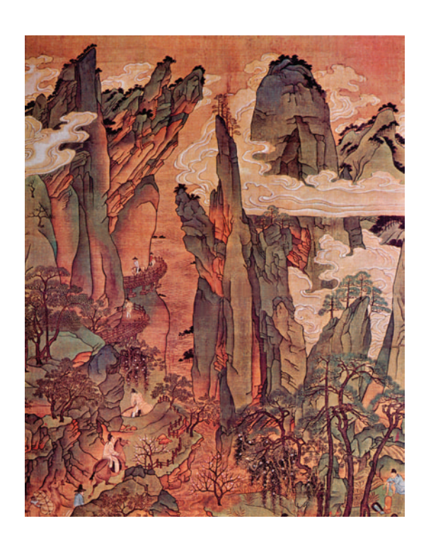
Trying to Get Into the Palace of Truth