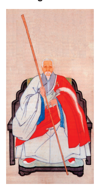
7 Being a Master

A lot of people have the world backwards. They think that in order to be a photographer, for instance, you need a whole set of cameras. This is not true. Some people think that in order to be a photographer you have to take pictures. Once again it is not true. To be a photographer you only need to be a photographer.