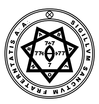
A∴A∴ Publication in Class D