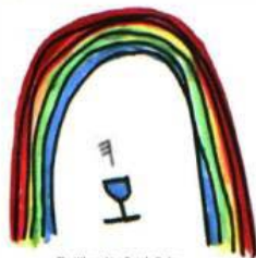
The Where Atlas Temple Order

TOP Right, I, YOD, the Father above H, HEH, the Mother TOP Left V, VAU, The Son above H, HEH, The Bride, the completion of all.