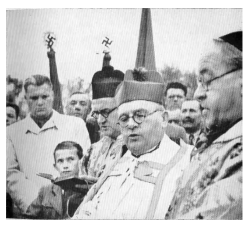
Roman Catholic clergy blessing Nazi emblems