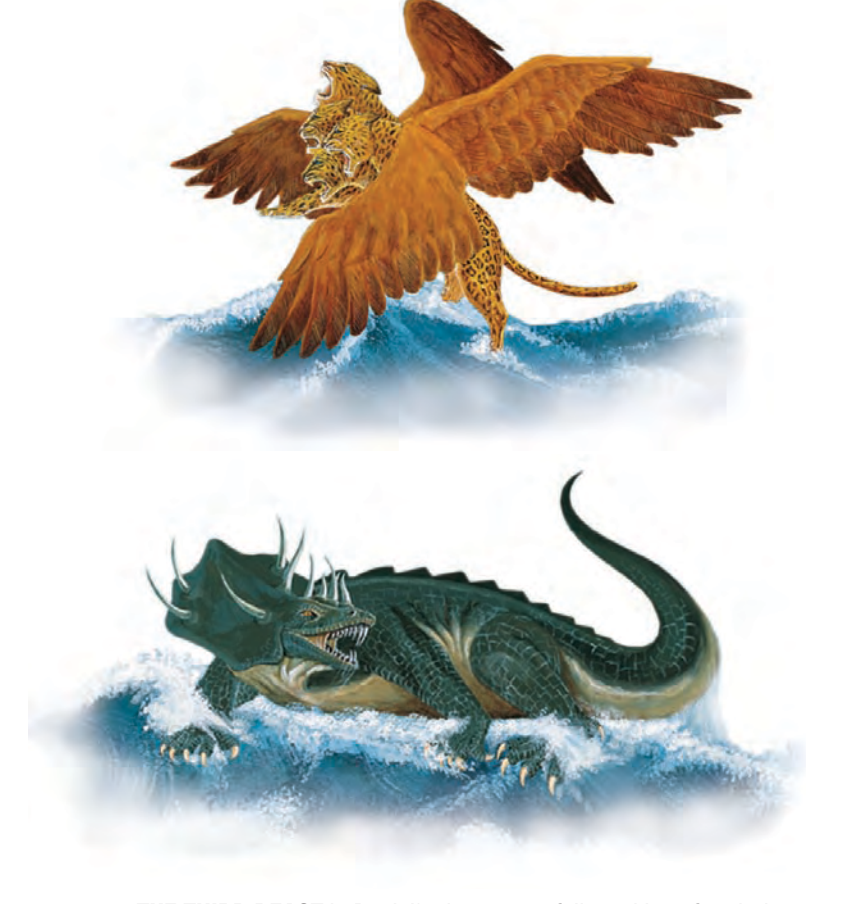
THE THIRD BEAST in Daniel's dream was followed by a fourth that was "dreadful and terrible" (Daniel 7).

"These great beasts, which are four, are four kings, which shall arise out of the earth," is the interpretation of verse 17.