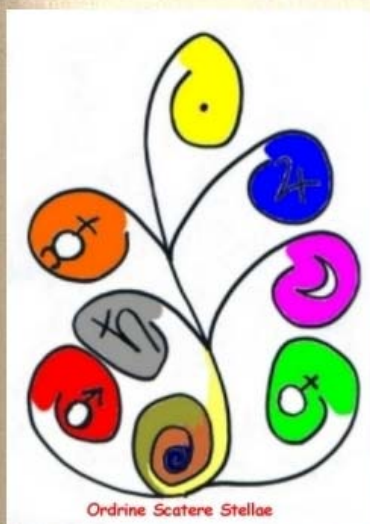
Ordine Scatere Stellae

The letters which accompany some of the Tarot cards represent secret keys as you will learn and realise after having got in touch with the relevant Geniuses. The seals of 72 are drawn in yellow, but it happens sometimes that a genius will want to have his seal drawn in a different colour. You must always follow such a command or your circle may master you.