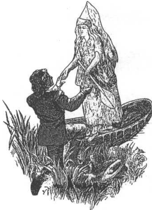
THE GWRAIG OF THE GOLDEN BOAT.