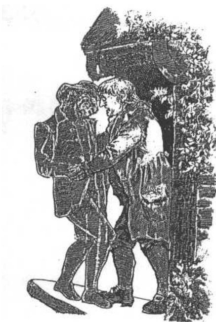
SHON AP SHENKIN RETURNS HOME.

he heard a little bird singing, in a most enchanting strain, on a tree close by his path. Allured by the melody he sat down under the tree until the music ceased, when he arose and looked about him. What was his surprise at observing that the tree, which was green and full of life when he sat down, was now withered and barkless ! Filled with astonishment he returned to the farmhouse which he had left, as he supposed, a few minutes before; but it also was changed ,grown older, and covered with ivy. In the doorway stood an old man whom he had never before seen; he at once asked the old man what he wanted there. 'What do I want here?' ejaculated the old man, reddening angrily; 'that's a pretty question Who are you that dare to insult .me in my own house?' 'In your own house ? How is this? where's my father and mother, whom I left here a few minutes since, whilst I have been listening to the charming music under yon tree, which, when I rose, was withered and leafless?'