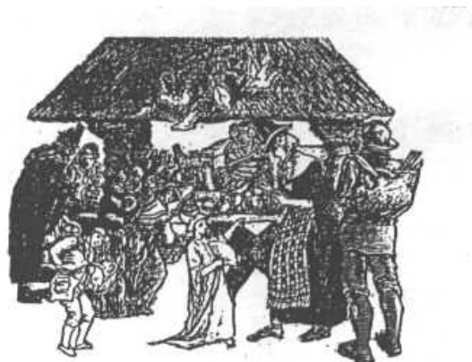
FAIRIES MARKETING AT LAUGHARNE.

and fro between the islands and the shore through a subterranean gallery under the bottom of the sea.