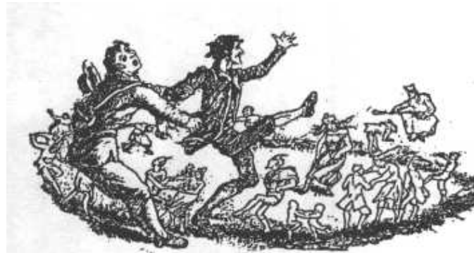
PLUCKED FROM THE FAIRY CIRCLE.

home, and to all inquiries concerning Iago. he answered, 'Gone to the cobbler's in the village.'