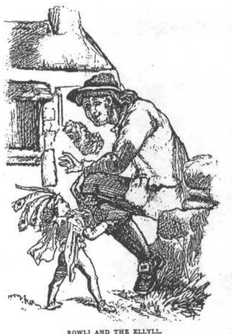
ROWLI AND THE ELLYLL

going to America, for there was no America in those days. Well, and if there was, the poor Welshman didn't know it. So as Rowli was sitting on his wall one day, hard by his cottage, musing over his sad lot, he was accosted by a little man who asked him what was the matter. Rowli looked around in surprise, but before he could answer the ellyll said to him with a grin, 'There, there, hold your tongue, I know more about you than you ever dreamed of knowing. You're in trouble, and you're going away. But you may stay, now I've spoken to you. Only bid your good wife leave the candle burning when she goes to bed, and say no more about it.' With this the ellyll kicked up his heels and disappeared. Of course the farmer did as he was bid, and from that day he prospered. Every night Catti Jones, his wife, [Until recently, Welsh women retained their maiden names even after marriage] set the candle out, swept the hearth, and went to bed ; and every night the fairies would come and do her baking and brewing, her washing and mending, sometimes even furnishing their own tools and materials. The farmer was now always clean of