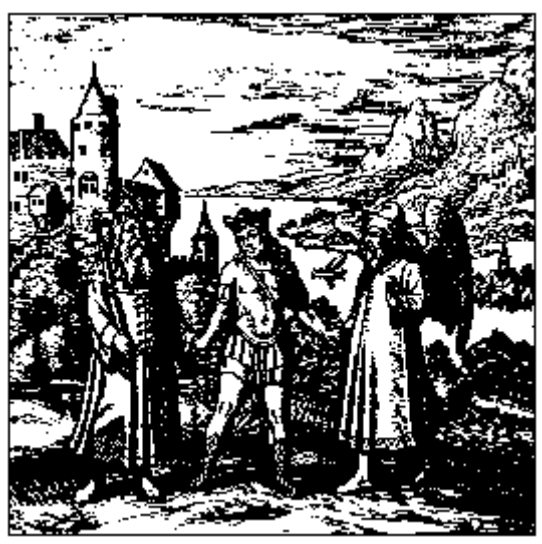
THE THREE ARE BODY, SOUL, AND SPIRIT.