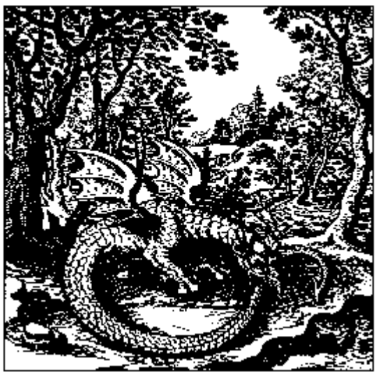
The Mercury is precipitated or sublimed, dissolved in its own proper water, and then once more coagulated.

THIS SURELY IS A GREAT MIRACLE AND WITHOUT ANY DECEPTION - THAT IN A VENOMOUS DRAGON THERE SHOULD BE THE GREAT MEDICINE.