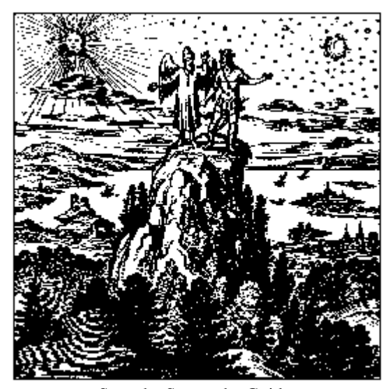
Says the Son to the Guide: I will go down to my Father, For he cannot live without me. He sighs and calls aloud for me. And the Guide makes answer to the Son: I will not let thee go alone; From thy Father's bosom I brought thee forth, I will also take thee back again, That he may rejoice again and live. This strength will we give unto him. So both arose without delay, And returned to the Father's house. When the Father saw his Son coming, He cried aloud, and said: -