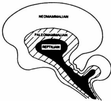
Figure I. The Triune Brain, courtesy Paul MacLean

I should like now to look at another source of insight into archetypal functioning, namely, the study of dreams.