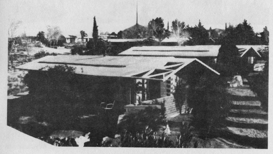
Guest Cottages at the Mentalphysics Teaching and Spiritual Center

Your Mind and Its Mysteries Your Eyes Your Ears Constipation The Living Word Food for Thought Library of Victorious Living