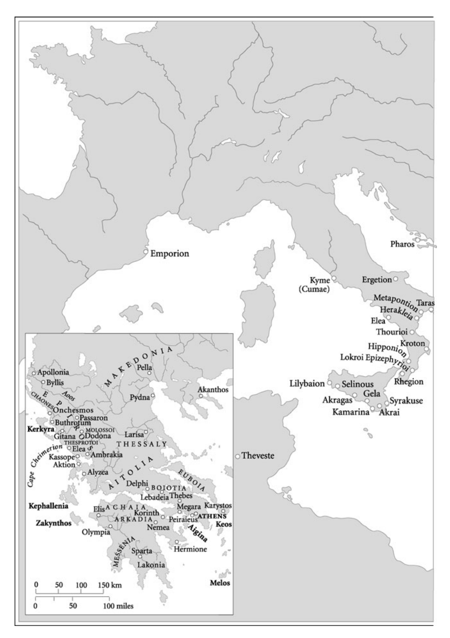
MAP 1. Synchronic map showing all the major sites mentioned in the text (it shows the fourth-century locations of the tribes in Epiros, according to Hammond 1967)