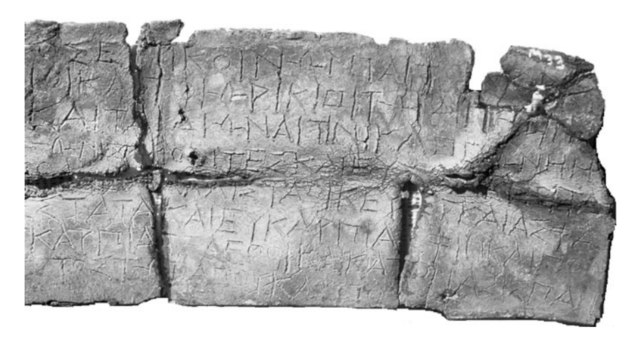
FIG. 1. Oracle question tablet from Dodona: 'God. The Kerkyraians and the Orikians ask Zeus Naios and Dione, by sacrificing and praying to which of the gods or heroes they may live most fairly and safely, and may there be fine and fruitful crops for them and enjoyment of every good fruit' (third century BCE)

century. It starts off with a general concern about good fortune 'To the gods. With good fortune. The city of the Tarentines ask Zeus Naios and Dione about every good fortune and concerning the . . . . '55 There the tablet breaks off, but the second half looks as if they were going to follow up with a more specific request, and some of the other community question tablets may give us ideas of how to fill in the gap.