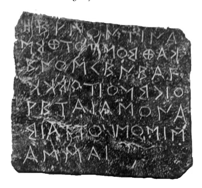
Fig. 3. Oracle question tablet from Dodona: In this tablet, a man called Hermon asks to which of the gods he should turn to in order to get children from a woman Kretaia (end of sixth/beginning of fifth century BCE)

4. Karapanos 1878: pl. 35, 1; Athenian or Ionian (Kyklades)