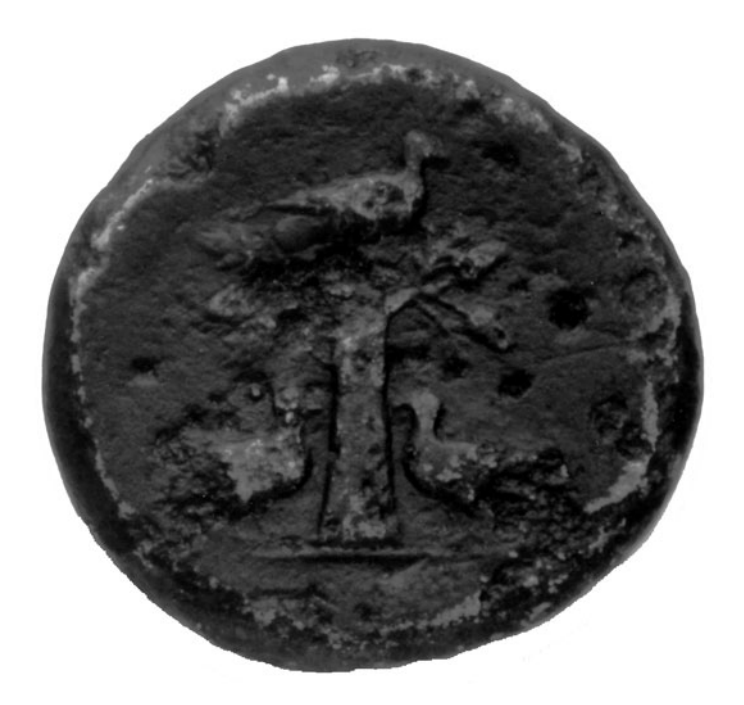
Fig. 2. Bronze coin from Dodona with oak tree and three doves, 300 bce

to Dodona were asking about journeys that they were planning to make down the coast or across the Adriatic. This suggests that, although common, such expeditions were scarcely risk-free. Apart from the hazards of being on water, there was always the threat of piracy, especially it seems from the Illyrians and, later, the Aitolians.<sup>66</sup>