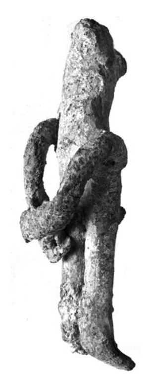
Fig. 5 continued.

remain anonymous.<sup>16</sup> Of course, the author of the curse was not necessarily the same as the person who actually inscribed the text. The use of repetitive formulae and the discovery of caches of curse tablets written, or tiny dolls shaped, by the same hand, suggest the activities of the salesmen Plato describes in the Republic .<sup>17</sup> But not all these writers were professionals: some tablets betray a more amateur approach through the use of less fine or near-illiterate inscribing; others a more personal style, by their use of particular expressions. 18 Consider, for example, DT 86, which is quoted at the beginning of the Introduction to this book. This curse is directed against a hetaira—a highclass sex-worker—called Zois and targets parts of her body and aspects of her behaviour, including her buttocks, her laughter, and her eyes. These targets are unusual, not found amongst the common cursing formulae, and evoke the sexual power of this woman, a power that someone was obviously desperate to disable. In another example, a text from Makedonia, a woman called Phila curses first the (imminent?) marriage between Dionysophontos and a woman called Thetima, then widens her hit list to include 'any other