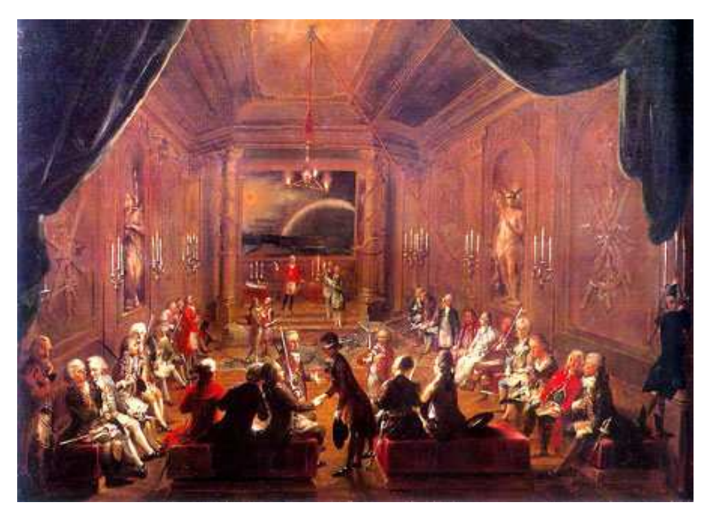
Seen above an 18th century painting of a Viennese Lodge

Sion is French for Zion or Mt. Zion, the holy mountain in Jerusalem which was consdered the centre of the world and unique and sacred place "where God dwelled." Thus it was inteneded that Templum Sion be a unique place of contemplation, thoughtful discussion and inquiry into our ancient Mysteries and a place where men of equality and distinction could meet and operate. It is a place of sanctity and meaning.