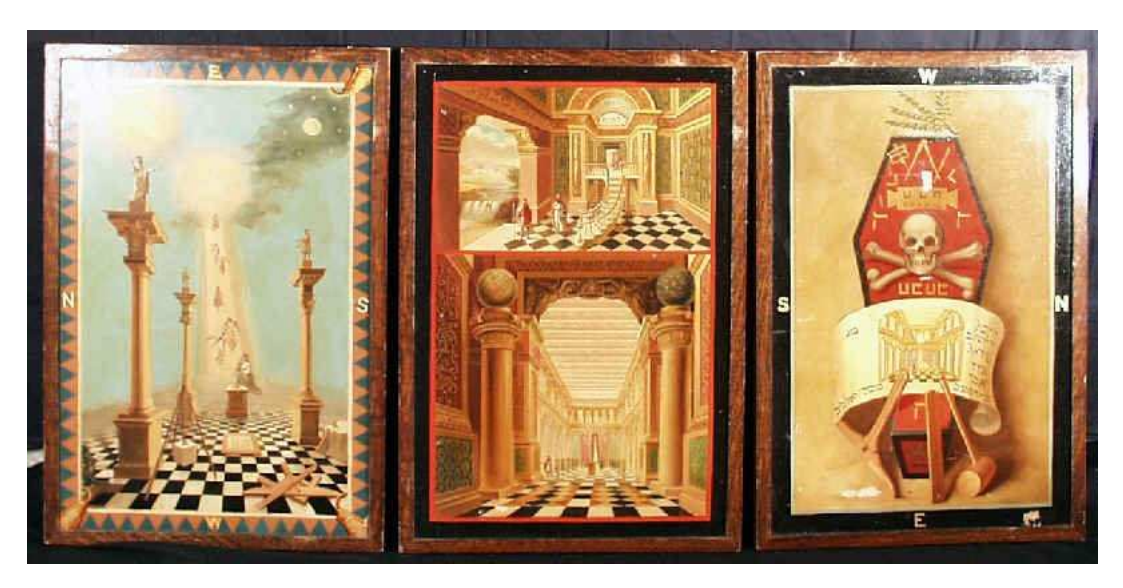
Above- The three degree tracing boards of St. Andrews Lodge, Scotland.

Masonic Tracing Boards are training devices. In the earliest days of speculative Masonry, the Master would sketch designs on the floor of the Lodge using chalk. Then he would talk about the drawing during the meeting. During the course of the 18th century, the drawings were transferred to "Tracing Boards" which are pictures, one per Degree, that encapsulate the symbols of each of the Degrees. The Boards to which we will refer are English.