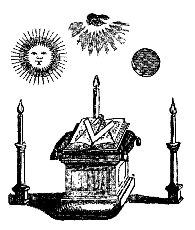
Entered Apprentice From an 1860 Webb's Monitor

As in all development, physical, intellectual, and spiritual, the foundation must be well grounded. The very first question asked of a candidate for the degrees is if he believes in the existence of God, because without this belief he has not the foundation on which to build a lasting Masonic life. Our main concern in Masonry is with the intellectual and spiritual development. This is why it is so important that the teachings of the First Degree be so well considered and understood before progressing on to the second step.