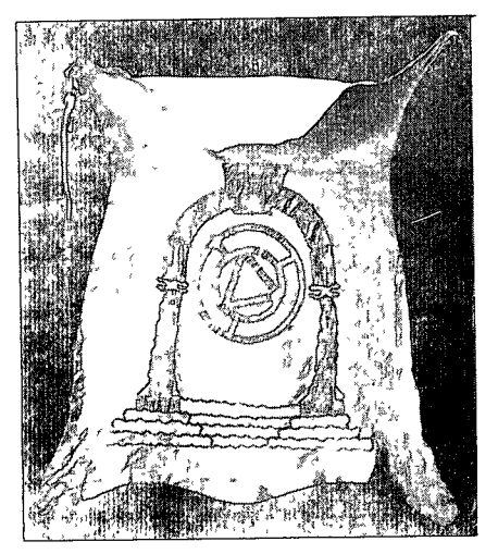
This is one of the oldest Masonic Aprons It is made from the whole skin of an animal The neck forms the flap Tie strings are attached to the legs. The emblems are formed by pink ribbons sewed to the skin. It is preserved in the Grand Lodge Museum, London Operative masons wore aprons similar to this. They were plan skins without emblems

belt which also served to carry some tools Over the front the workman wore an apron composed of the whole hide of an animal, probably a lamb or a calf. Gloves were worn when needed to protect the hands from splinters and these were generally gauntleted when working on scaffolding