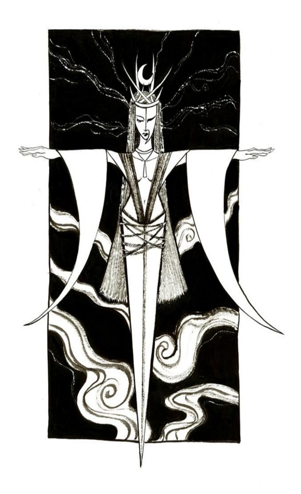
The Oracle of Ereshkigal