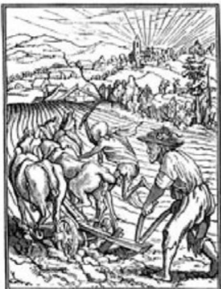
Rich man, old man, merchant, and farmer. From Imagines Mortis by Hans Holbein the Younger and printed by J. Frellon, Lyons, 1547. See: Lehner, E. and Lehner, J.: Devils, Demons, Death, and Damnation . Dover Publications, New York City, 1971. Fig. 134, 135, 136 and 137. (BW)