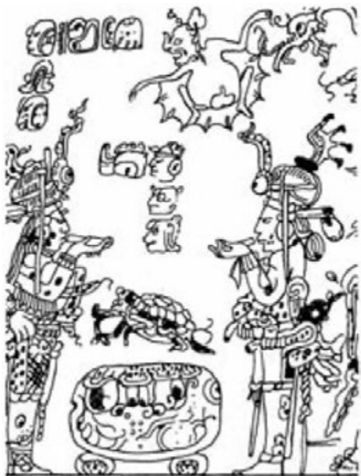
Mayan Hero Twins. Drawing after a Mayan vase depicting the Hero Twins, Hunahpu and Xbalanque, whose resourcefulness helped them to vanquish the Xibalba lords. The bat hovering overhead recalls their ordeal in the House of Bats, where Hunahpu was decapitated

infant mortality, and the combination of warfare and sacrificial rituals made death an ever-present reality in their everyday life. Much of Mayan ritual and art was dedicated to posthumous existence, from the soul's entrance into the Underworld, Xibalba, to a final rebirth and apotheosis. Mayan mythology and funerary art described death as an intricate journey. Its important stages and challenges were depicted on coffins, wall paintings, pottery, jades, and other objects, which accompanied the deceased during the great transition.