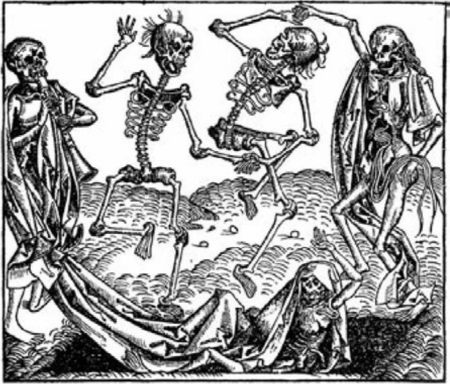
Dance of death. Pictures from La dance macabre des hommes (the Dance of Death of Men), printed by Guyot Marchant, Paris, 1486. Scenes from La dance macabre des femmes (the Dance of Death of Women), printed by Antoine Verard, Paris, 1486. See: Lehner, E. and Lehner, J.: Devils, Demons, Death, and Damnation . Dover Publications, New York City, 1971. Fig. 134,135,136 and 137. (BW)

Holbein the Younger from the first half of the fifteenth century is another famous series of powerful illustrations depicting various themes of Ars moriendi .