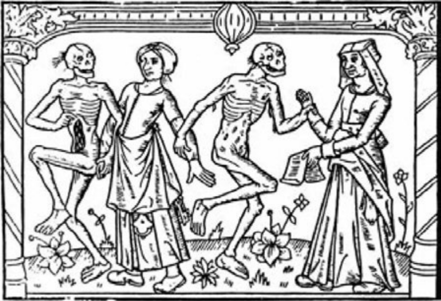
Bride and prostitute. From La danse macabre des femmes (The Dance of Death of Women), printed by Antoine Verard, Paris, 1486. See: Lehner.E. and Lehner, J.: Devils, Demons, Death, and Damnation . Dover Publications, New York City, 1971. Fig. 134,135, 136 and 137. (BW)