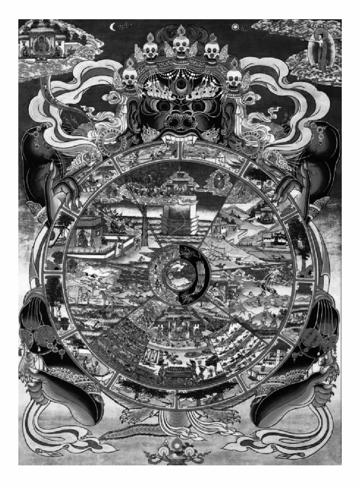
The Wheel of Life (Bhavacakra). The nidanas are situated in the outer rim of the wheel.