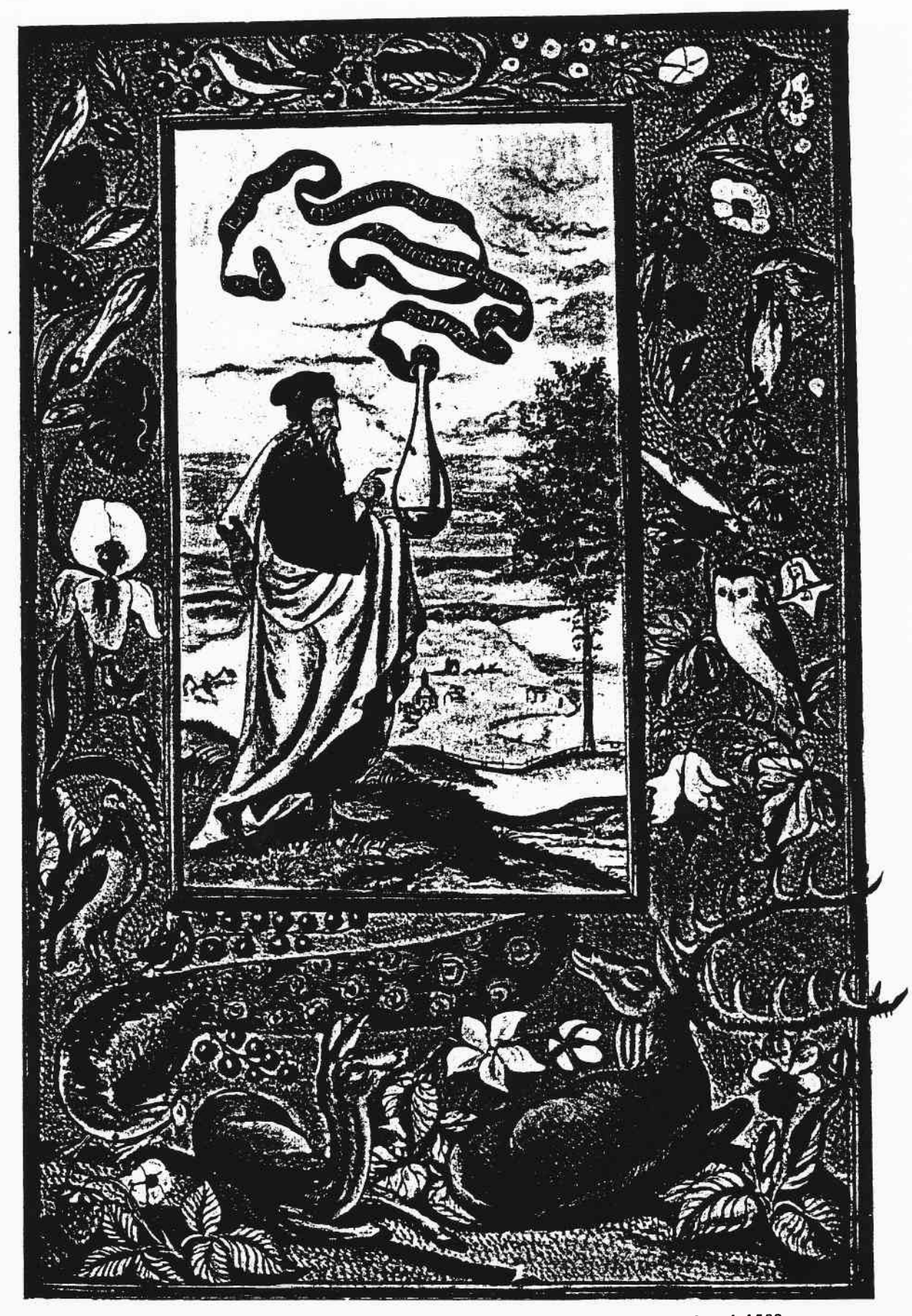
Illustration from Splendor Solis - Unique Manuscript on Vellum, dated 1582, in the British Museum.