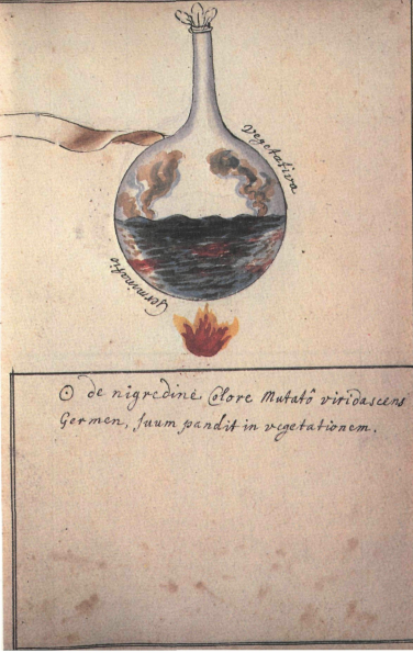
The Germination of vegetation.

The sun having been changed through the black colour becomes green, it is spread out into the vegetation.