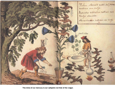
Our sharp bitter vitriol is not that of the vulgar