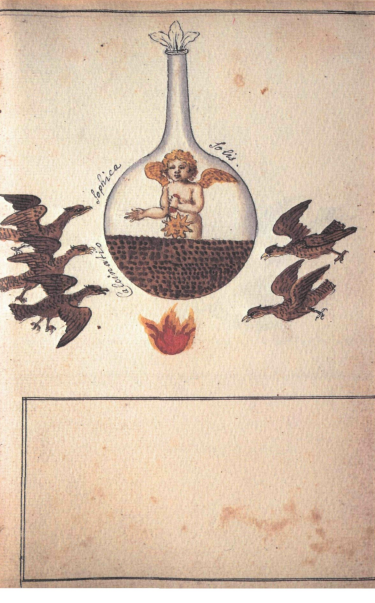
The sophic calcination of the sun.