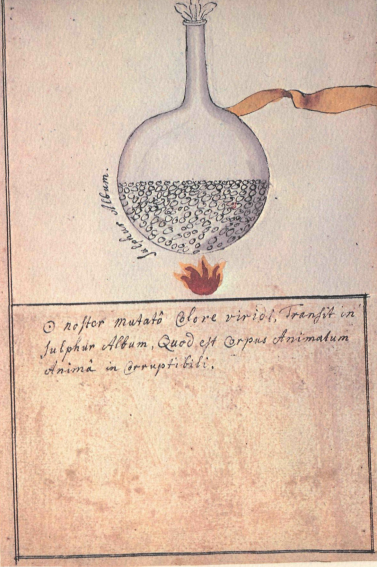
The white sulphur.

Our sun having been changed into a green colour, passes into white sulphur, which is the body animated by the incorruptible soul.