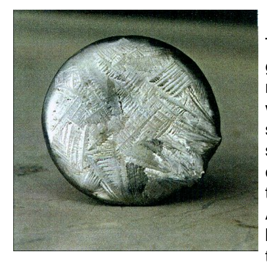
Alchemy Journal Vol.2 No.5.

The cruciferous globe, that Volcano holds in the left hand and is to give to one of the old alchemists, is the symbol of the earth or of the mineral subject, that the artist has to seek and to identify to begin the work. The star that we see in the center of the globe symbolizes the starry martial regulus , proceeding from the separation and succeeding purifications, done by the fire and for the salt. Under the cruciferous globe a stream runs, which symbolizes our living water , that is to say the Mercury , that will be animated later. The Sheep or Aries symbolizes, astrologically, the favorable season for the beginning of the works, also clearly identified by the foliage of the tree. Besides, the metallic correspondence of Aries is the same as