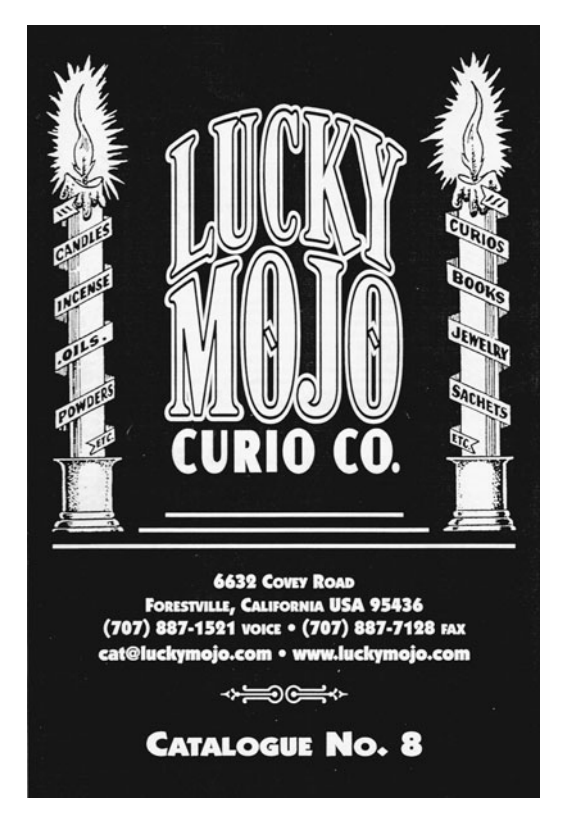
A common feature of twentieth-century hoodoo, the mail-order catalog, this one from a California-based company.

in place of the traditional conjure doctor-client relationship. It also helped to create greater uniformity in the practice of hoodoo, erasing many of the regional distinctions that had once set Anglo Zone conjure apart from Latin Zone hoodoo. On the downside, it aided the larger process by which Americans of all backgrounds became ever more separate from the natural world. More specifically, it detached African Americans from many of the herbal and animal curios and magical concepts that their ancestors had brought from Africa. Moreover, the greater visibility created by large-scale businesses and advertising made it easier for state and national governments to suppress such "superstitions" by prosecuting practitioners for mail fraud, practicing medicine without a license, and other alleged crimes (Anderson, Conjure , 149; Long, Spiritual Merchants , 131–139, 145).