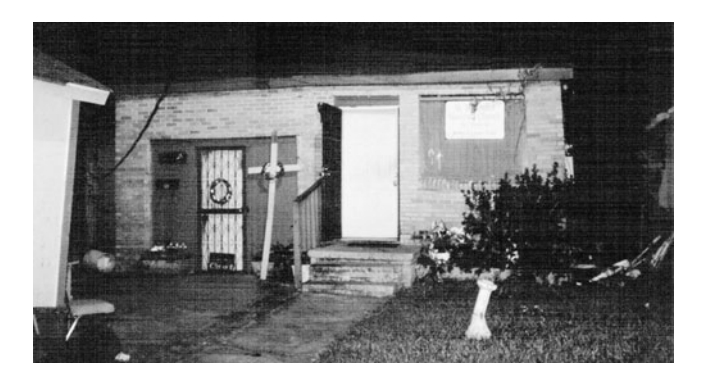
A small New Orleans Spiritual Church before Hurricane Katrina.

Baer, author of The Black Spiritual Movement , identified Chicago, New Orleans, New York, Detroit, and Kansas City as major centers of early Spiritual church activity. Basing his interpretation on documentary sources that trace the founding of early Spiritual churches to the first two decades of the twentieth century, Baer concluded that the Great Migration of rural southern blacks to the urban North led to the rise of this new belief system. His interpretation raises questions about just where the new beliefs came from. Quite possibly there were already prototypes for the Spiritual churches underwent significant development in the context of New Orleans Voodoo and hoodoo (Baer, Spiritual Church Movement , 17–24; Jacobs and Kaslow, 30–48).