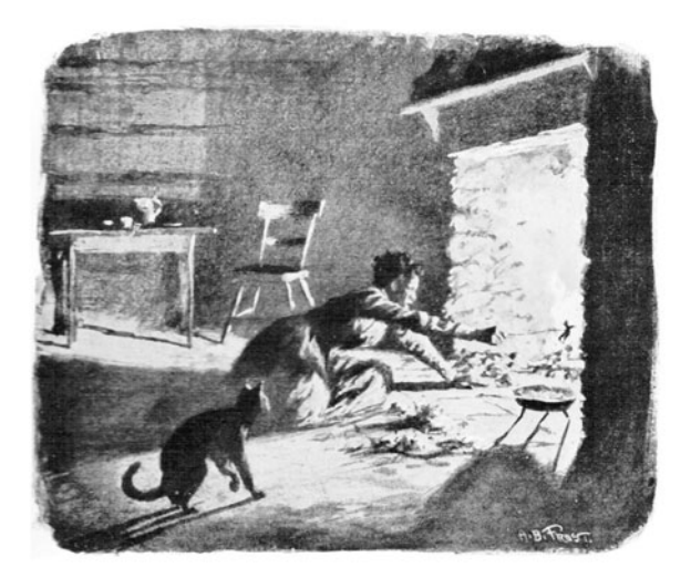
A hoodoo practitioner burning a "Voodoo doll," the embodiment of threatening hoodoo. Virginia Frazier Boyle, Devil Tales , with illustrations by A. B. Frost (1900; reprint, Freeport: Books for Libraries Press, 1972), facing p. 98.

order. At times, it was the prevailing Christian religion that felt itself assailed by black beliefs. That New Englanders accused African Americans of witchcraft during the seventeenth century testifies to whites' fears for their faith. Seen from a European American viewpoint, conjurers' magic worked to undermine religious belief. By definition, practitioners were servants of Satan (McMillan, 104; Breslaw, 535–556).