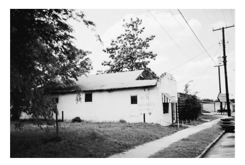
A modern spiritual supply shop in an urban area. It supplies both traditional herbs and manufactured items.