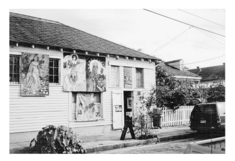
One of New Orleans' best known modern Voodoo shops. Its products derive primarily from Haitian Vodou.

magical and religious society known as the Abakuá Society has survived as an entity largely independent of either faith.