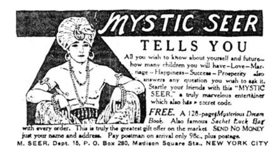
An advertisement for a divination service that appeared in a prominent African American newspaper. Note the use of a stereotypical Indian imagery to promote the effectiveness of the product. The Chicago Defender , July 5, 1924, 2:7.

interesting, because it is called that in all of the Afro-Caribbean religions. The Southern Hoodooists also make references to this.