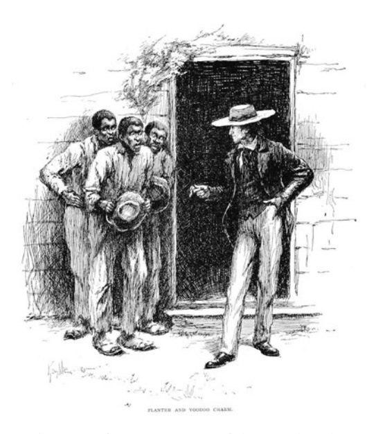
A planter confronting a group of slaves with a charm. Note the white man's disdain for it, which sharply contrasts with the concern evident in the African Americans' faces. George Washington Cable, "Creole Slave Songs," with illustrations by E. W. Kemble, The Century Magazine 31 (1886): p. 821.

rushes. It would be hard to find in nature a more painfully desolate region. Here in a fisherman's cabin sat the Voodoo worshipers cross-legged on the floor about an Indian basket of herbs and some beans, some bits of bone, some oddly wrought bunches of feathers, and some saucers of small cakes. The queen presided, sitting on the only chair in the room. There was no king, no snake—at least none visible to the onlookers. Two drummers beat with their thumbs on gourds covered with sheepskin, and a white-wooled old man scraped that hideous combination of banjo and violin, whose head is covered with rattlesnake skin, and of which the Chinese are the makers and masters. There was sing-ing"—" M'allé couri dans déser " ("I am going into the wilderness"), a chant and refrain not worth the room they would take—and there was frenzy and a circling march, wild shouts, delirious gesticulations and posturings, drinking, and amongst other frightful nonsense the old trick of making fire blaze from the mouth by spraying alcohol from it upon the flame of a candle.