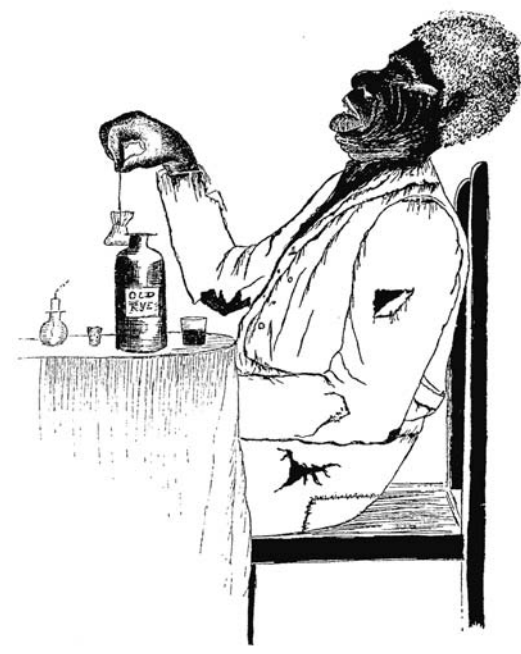
THE KING OF THE VOODOOS.

An 1894 fictional account of a hoodoo-related prosecution clearly illustrates white viewpoints. Entitled "A Case of Hoodoo," it tells of Washington Webb, a