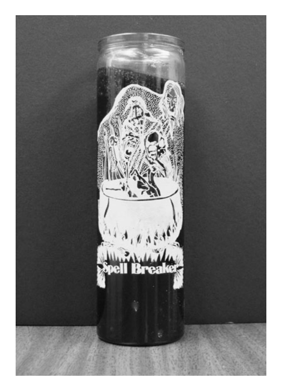
An example of the type of candle used in hoodoo ceremonies. Author's personal collection.

type of luck ball, required a complex series of rituals that involved collecting red clovers, tinfoil, and dust; using cotton and silk threads to tie knots around these magical materials; praying; spitting whiskey on the charm; and sending the charm's indwelling spirit into a nearby forest. It was important that the future possessors of such charms continue to feed them with whiskey and wear them under their right arms (Mary Owen, "Among the Voodoos," 232–233; Mary Owen, Old Rabbit , 169–189).