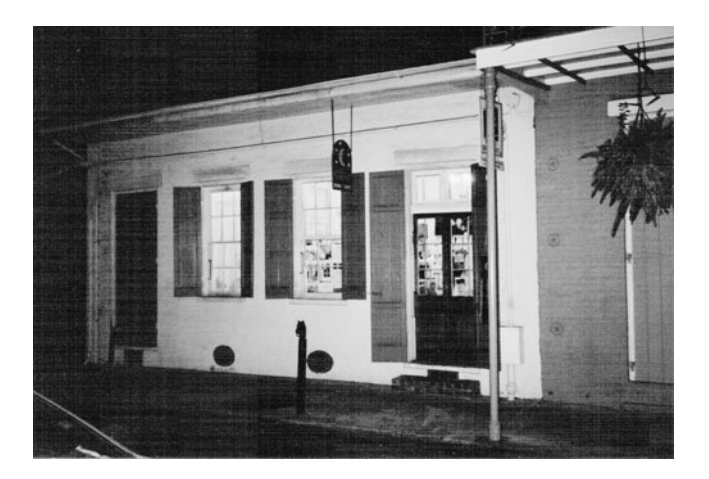
A modern New Orleans shop that not only caters to Voodoo but also a wide range of other alternative religions. Author's personal collection.

however, could very well disappear (Warner, http://www.nola.com/news/t-p/front page/index.ssf?/base/news-8/1186642536113410.xml&coll=1 and http://www.nola.com/news/t-p/frontpage/index.ssf?/base/news-/1186642536113410.xml&coll=1&thispage=2; Williams, interview by author [2007]; Chamani, interview by author [2007]; Glassman, interview by author [2007]).