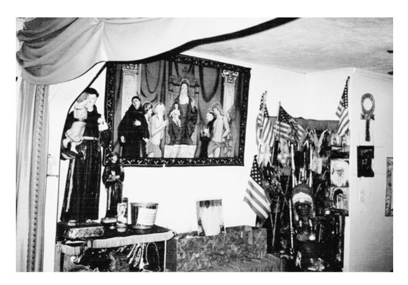
The altar of a New Orleans Spiritual Church. Note the blend of Catholic, Native American, and African elements. Of particular interest is the nganga -style bucket containing a small flag and Indian bust, in the lower right-hand corner.