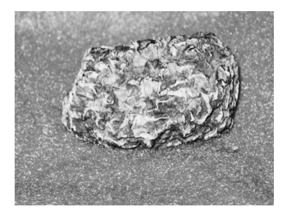
Jalap, the version of High John the Conqueror root most common today. It is unlikely that nineteenthcentury hoodoo practitioners used jalap.

To a significant extent, the development of the spiritual supplies industry simply reflected the general late nineteenth-century growth of big business, but