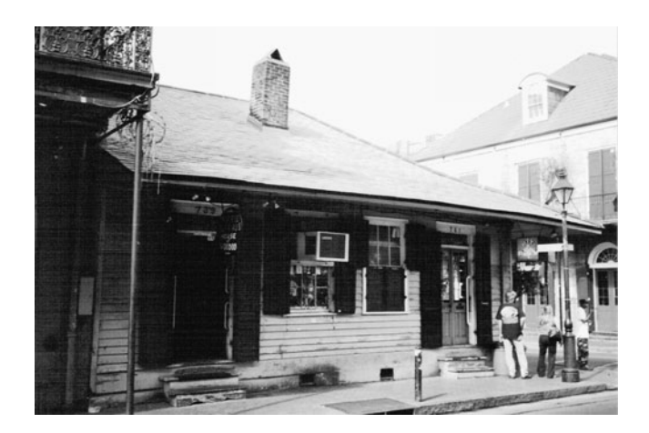
A popular tourist-oriented Voodoo shop on New Orleans's Bourbon Street. Outdated understandings of the religion continue to draw visitors to the Crescent City, many hoping to catch a glimpse of grotesque superstition or threatening magic.