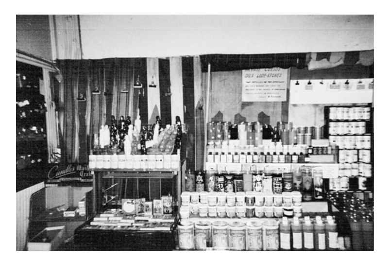
A portion of the spiritual supply section of a popular Memphis, Tennessee, shop.

healers as well. Plenty of practitioners do specialize, but most at least occasionally venture outside of their area of expertise (Yronwode, interview by author).