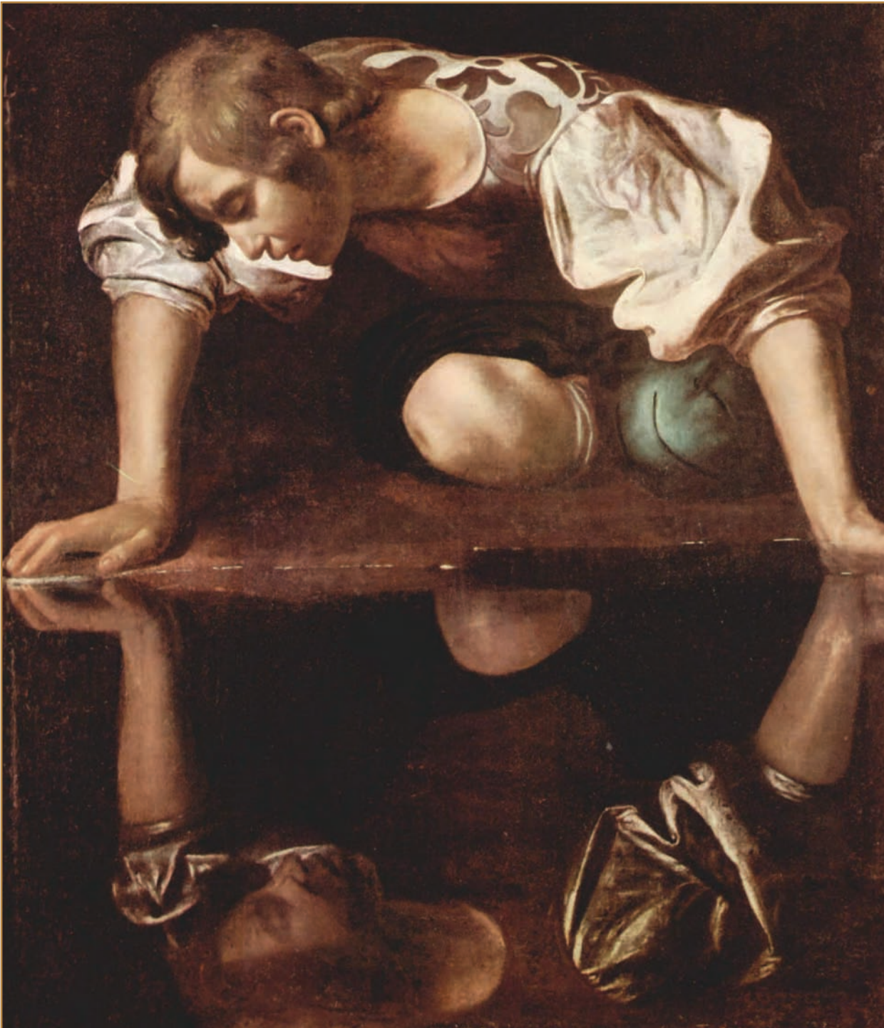
Narcissus stares at his reflection in a pool of water in this painting by Michelangelo Merisi da Caravaggio (1571-1610). The painting hangs in the Palazzo Barberini in the National Gallery of Ancient Art in Rome.

Some of the more prominent of the thousands of Naiads were MINTHE, who was loved by HADES, god of the UNDERWORLD; STYX, loved by the TITAN PALLAS; and ARETHUSA, whom ARTEMIS turned into a fountain.