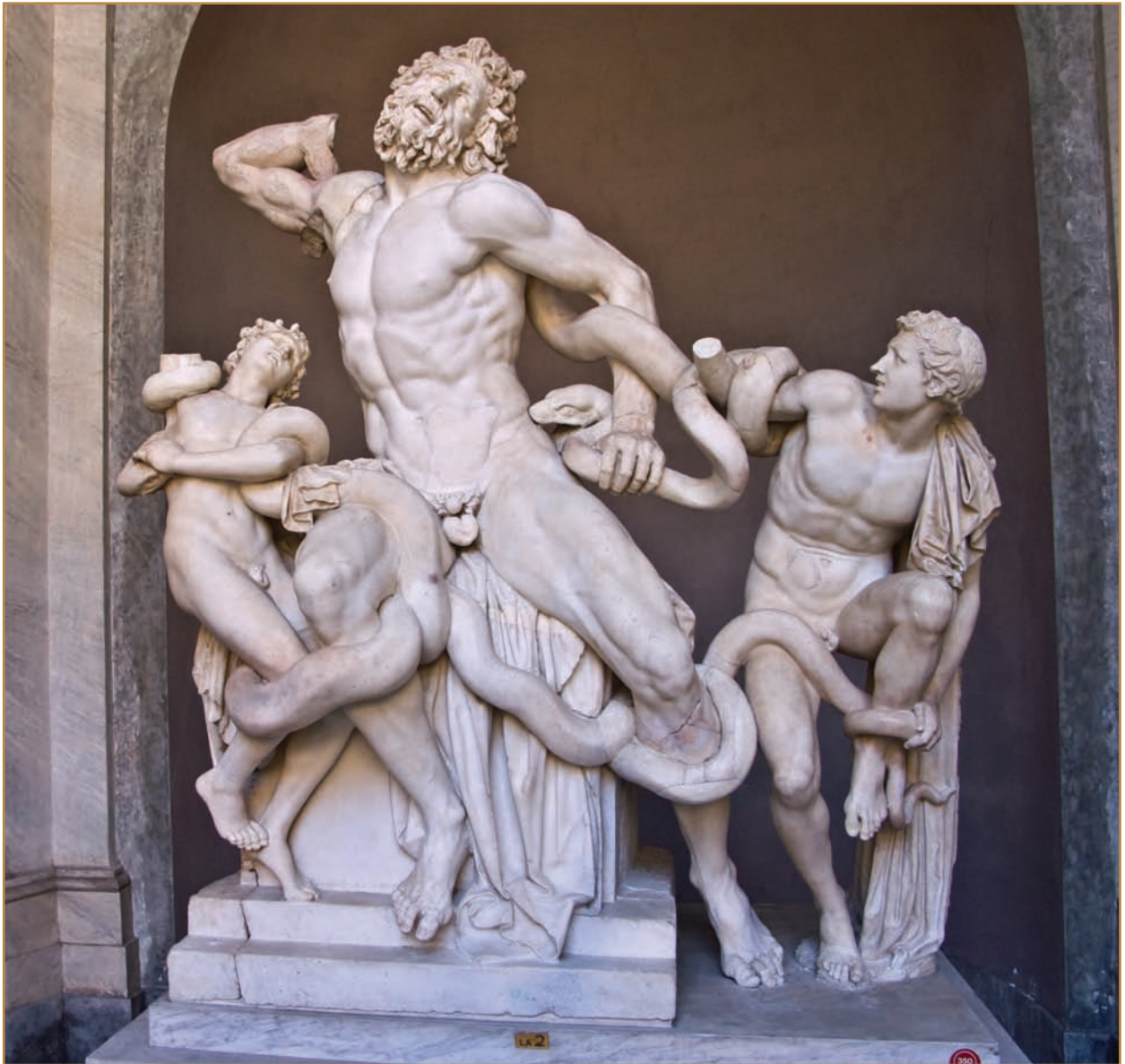
The Trojan hero Laocoön (center) and his two sons struggle against the giant serpents sent by the Greeks in this Roman marble sculpture, a copy of a Greek original from the second century B.C.

LAOMEDON Greek First king of Troy; father of PRIAM, HESIONE, and others. He was slain by the hero HERACLES.