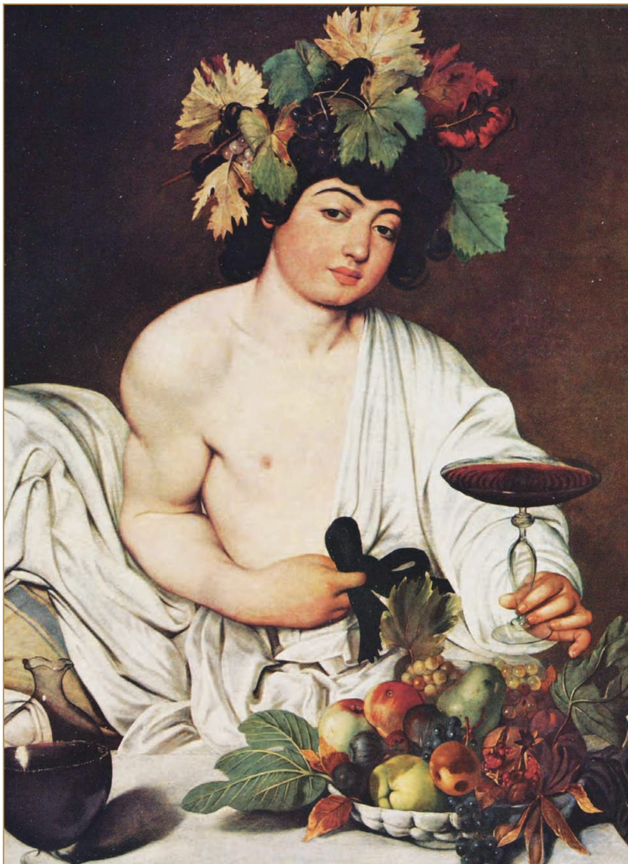
The Italian painter Michelangelo Merisi da Caravaggio (1571-1610) painted his vision of Bacchus, the Roman god of wine and excess, in the late 1500s. The painting hangs in the Uffizi Gallery in Florence, Italy.