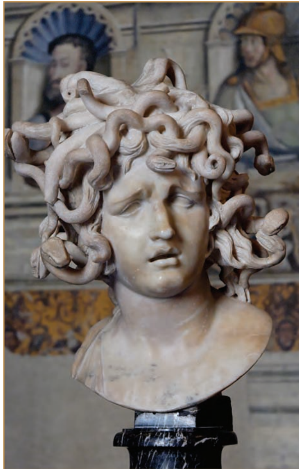
Italian artist Gian Lorenzo Bernini (1598-1680) created this bust of the witch Medusa and the snakes that form her hair. It is in the Musei Capitolini in Rome.

MEDUSA Greek One of the three GORGONS, the only one who was not immortal; her sisters were STHENO and EURYALE. Medusa was once a beautiful maiden, wooed by the sea god, POSEIDON, in a temple of ATHENE. The goddess was angry at the violation of her shrine and turned Medusa into a monster so hideous that anyone who looked upon her was turned to stone. PERSEUS cut off Medusa's head and used it to turn his enemies into stone. From the