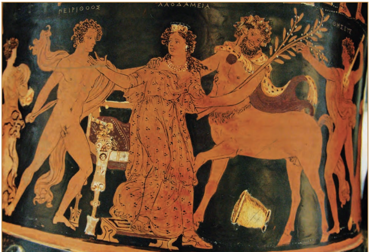
A centaur, a creature that was half horse and half human, tries to carry off Hippodameia, who was also known as Laodamia, at her wedding party. The scene is painted on ancient Greek red-figure pottery. This piece is in the British Museum in London.

HIPPOLYTA Greek Queen of the AMAZONS; daughter of ARES; wife of THESEUS; mother of Hippolytus.