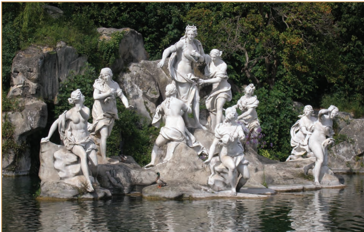
One of the many sculptures in the gardens of the royal palace in Caserta, Italy, near Naples, shows the Roman goddess Diana (center) frolicking with her attending nymphs.

king Belus, and sister of PYGMALION. According to the Roman poet VIRGIL, ANNA PERENNA was also Dido's sister. Dido was married to her wealthy uncle Acerbas. After Pygmalion murdered Acerbas, Dido fled to Carthage. Here she was allowed to purchase as much land as could be enclosed with the hide of a BULL. Dido cleverly had the hide cut up into narrow strips so that the area they enclosed was great. Her citadel was called Byrsa, and the city of Carthage arose around it more.