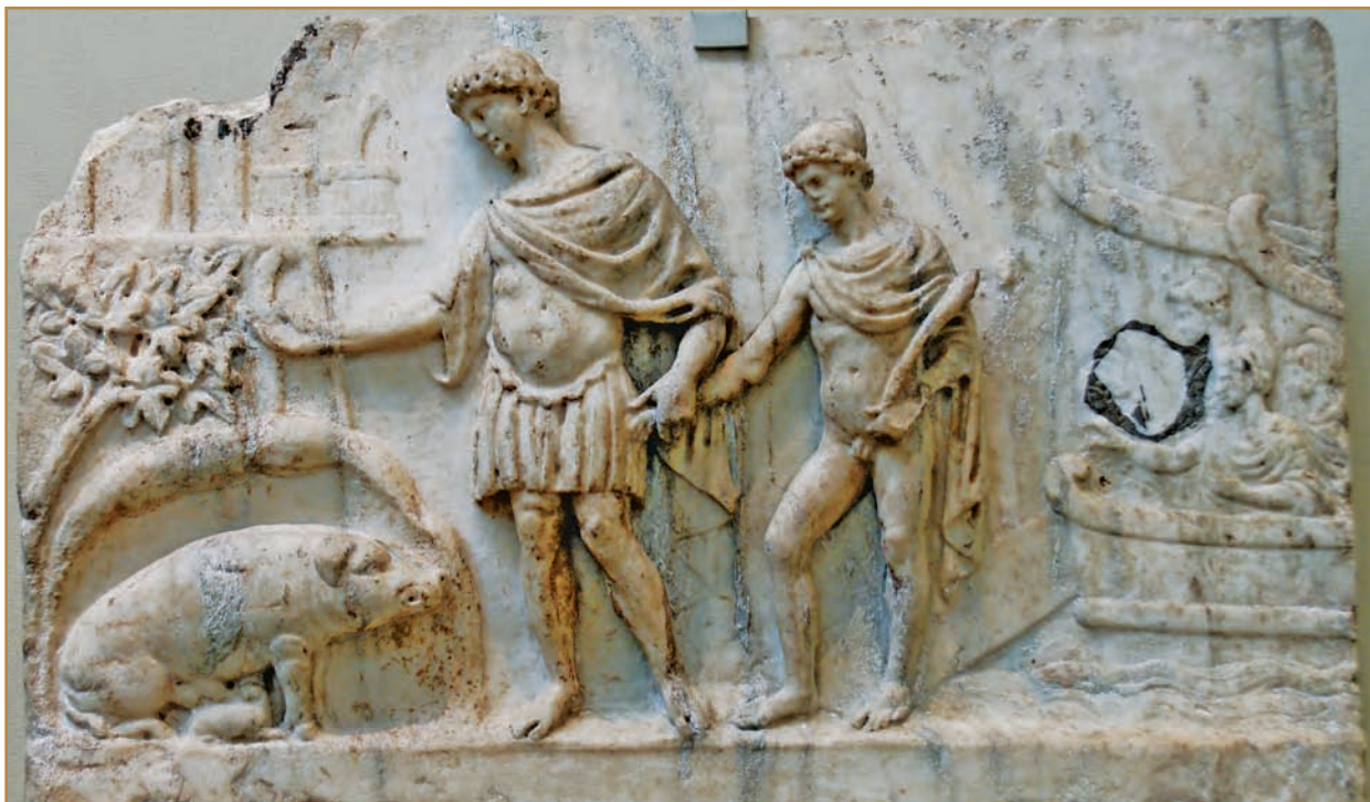
The story of Aeneas arriving with his son Ascanius on the shores of Latium is recounted in this marble relief carved in the second century A.D. The marble sculpture is in the British Museum in London.

Their journey to Italy took years and included many adventures. Though they were beset with turmoil and hardship, the great gods JUPITER, JUNO, NEPTUNE, and MERCURY watched over them, often intervening on their behalf.