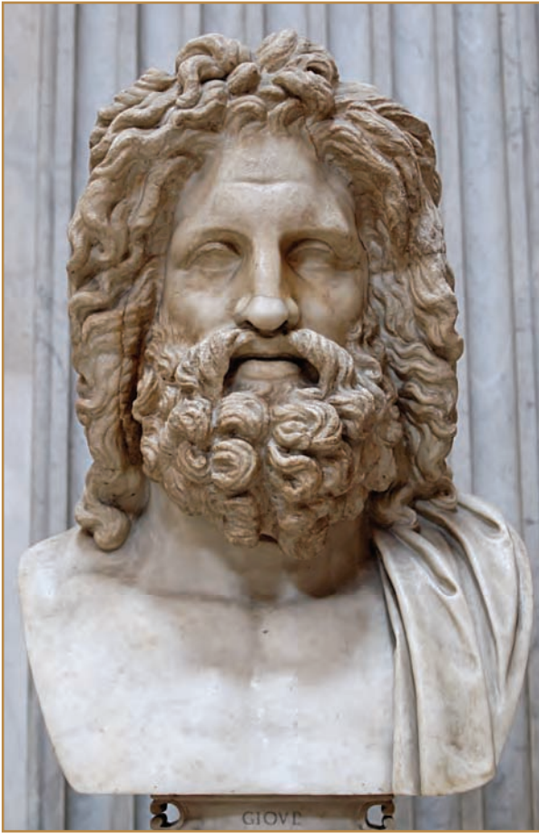
This ancient Roman copy of a Greek bust of Zeus was made in the third century and found in 1775 in excavations of the ancient site at Otricoli, north of Rome. It is now in the Vatican Museums in Vatican City.

gods and humans. After defeating his father, Cronus, Zeus reigned supreme over the gods of OLYMPUS, the home of the gods. He was the father of many children by Titanesses, goddesses, NYMPHS, and mortal women. Among his offspring were APOLLO, ARES, ARTEMIS, ATHENE, and DIONYSUS. (See The Loves of Zeus , below.) His most famous sanctuary was at DODONA.