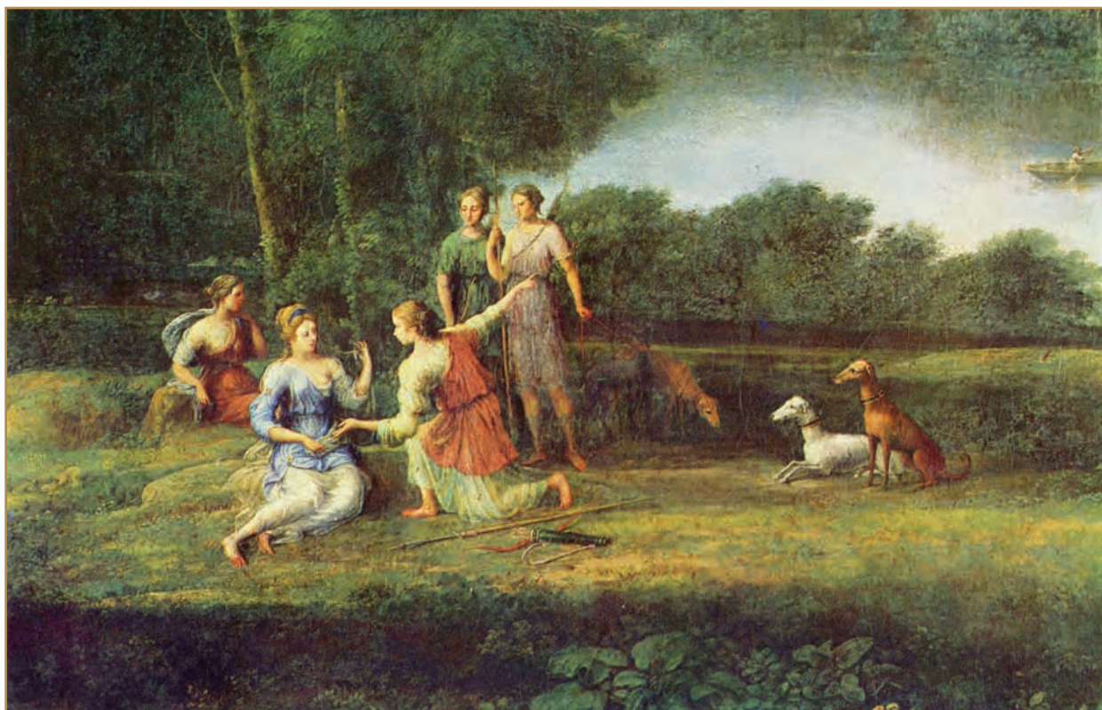
The Roman goddess Egeria mourns the passing of her love Numa Pompilius, the second king of Rome, in this painting by French artist Claude Lorrain (ca. 1600-1682). The painting is in the Museo di Capodimonte in Naples, Italy.

ECHIDNA Greek A monster-child of GAIA and TARTARUS or, in some tellings, of CETO and PHORCYC. Echidna was half human and half serpent. She once lived in a cave where she ate the flesh of men. With TYPHON, another monster, she had a brood of fright-