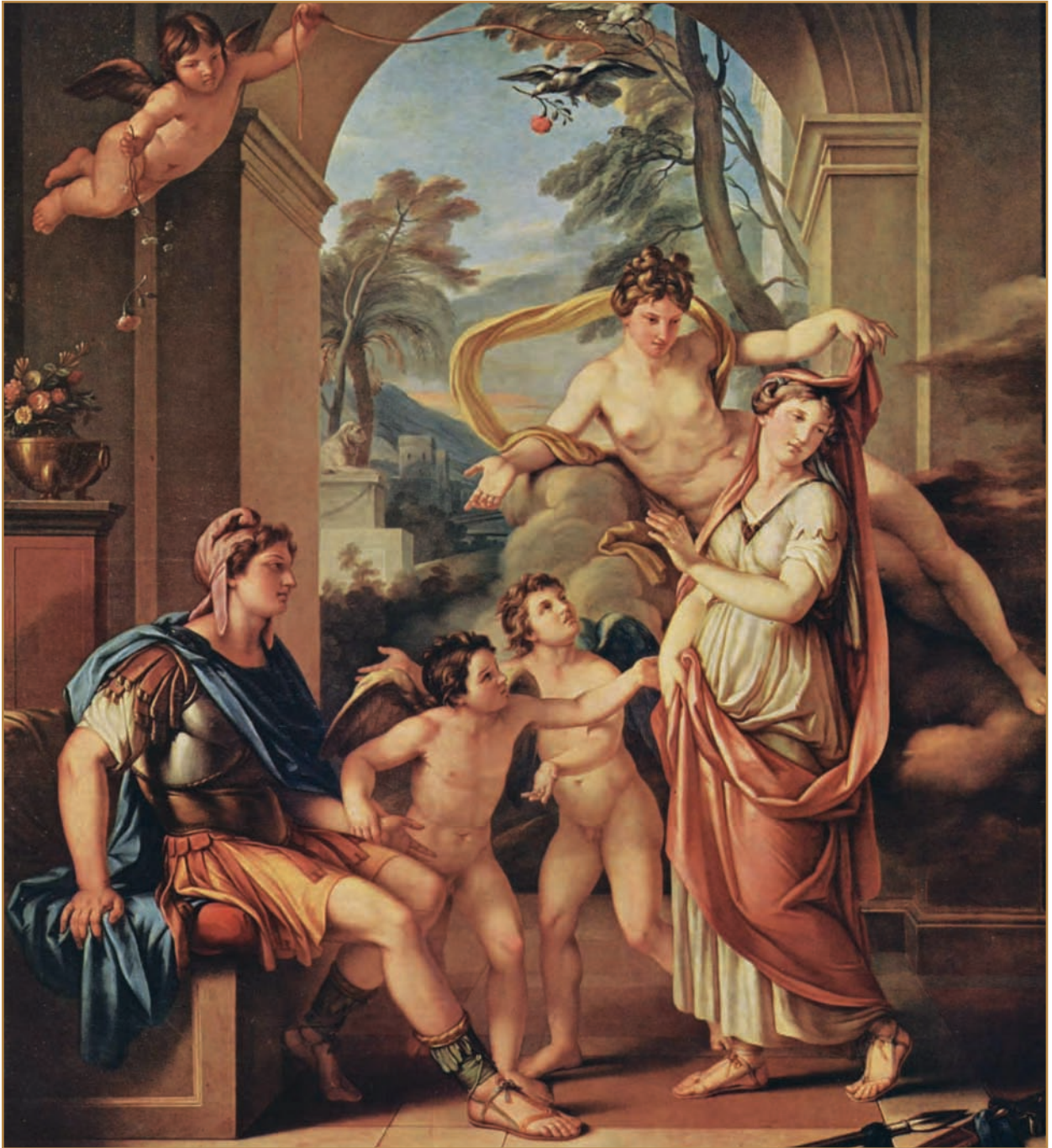
The goddess Venus (reclining above) gives Helen, the most beautiful woman in the world, to Paris in this painting by Scottish artist Gavin Hamilton (1723-1798). The painting hangs in the Museum of Rome.

HELLE Greek Daughter of ATHAMAS and NEPHELE; sister of PHRIXUS. Helle and her brother fled from INO, their stepmother, on the back of the winged ram with the famed GOLDEN FLEECE, which HERMES sent to them. One story has it that Helle fell from the air and drowned at a place in the ocean that came to be called the HELLESPONT in her honor, but Phrixus was rescued by AETES.