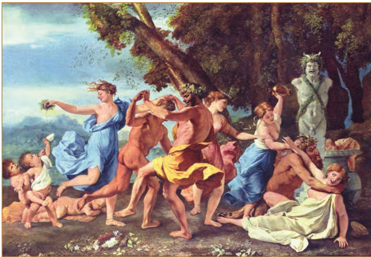
Nymphs celebrate a Bacchanalia, or wild party in honor of the god Bacchus, in front of a bust of the god Pan in this 1635 work by French painter Nicolas Poussin (1594–1665). It is located in the National Gallery in London.

BACCHE Greek One of the five NYMPHS who looked after the infant DIONYSUS on Mount Nysa. The other nymphs were Macris, Nysa, Erato, and Bromie.