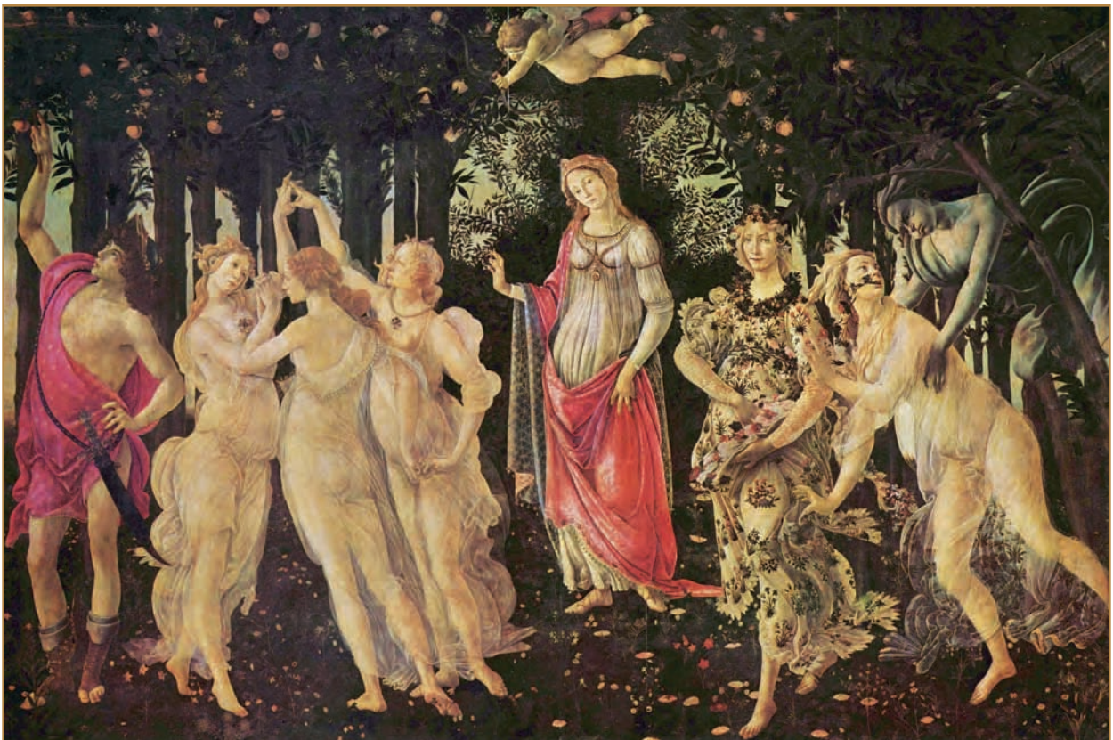
The great Italian artist Sandro Botticelli (1445-1510) painted Primavera (Spring) in 1478. It captures the scene of the birth of Venus (center in red). The goddess is surrounded by (left to right) Mercury, The Three Graces, Flora, Chloris, and Zephyrus. The painting is in the Uffizi Gallery in Florence, Italy.

Also living on the Italian Peninsula were the Etruscans, who appear to have been native to the region but may have arrived early in the first millennium B.C. They could not only write, a skill rare in Italy, but they were also skilled in