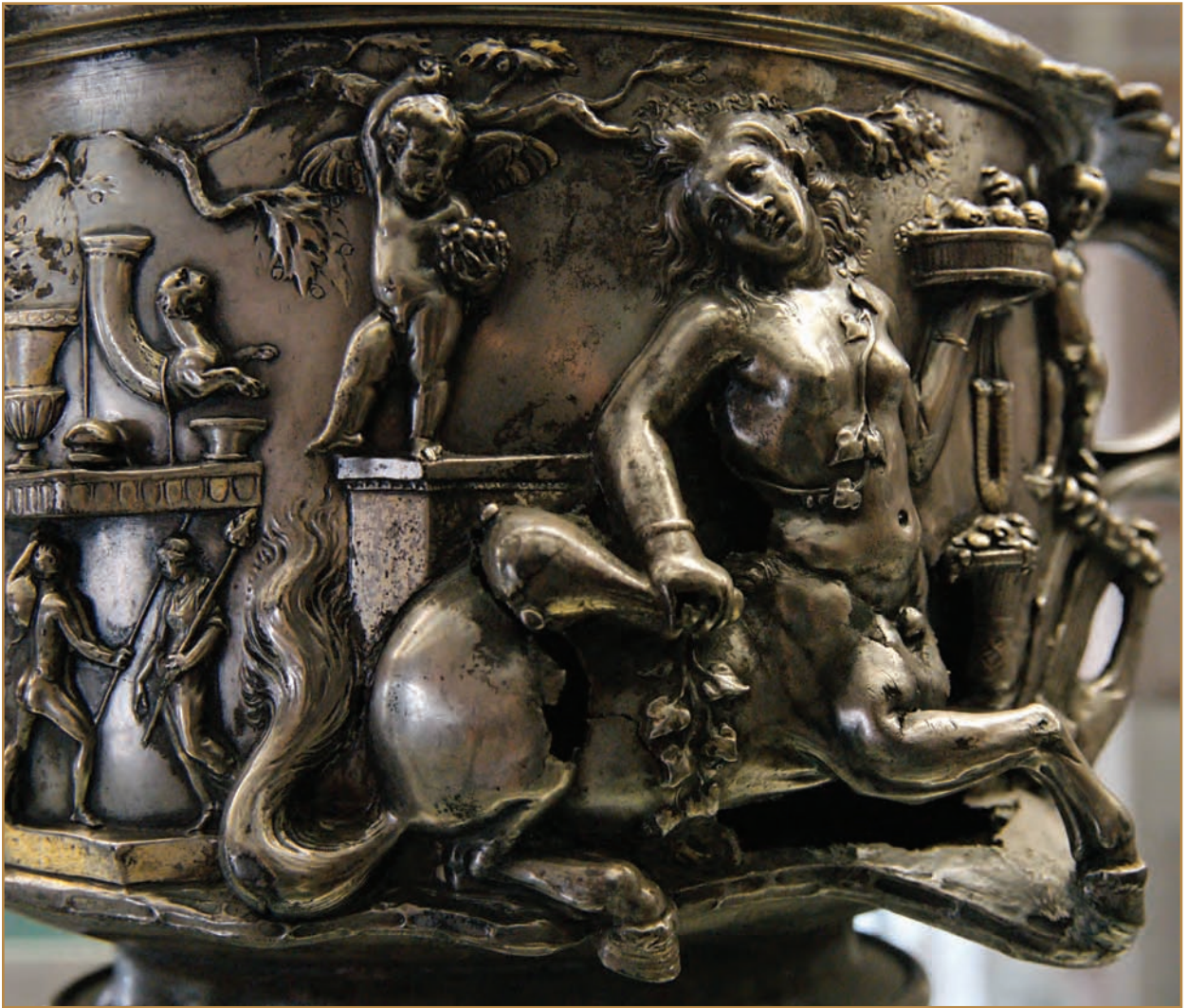
A female centaur decorates this first century A.D. metal cup which is in the National Library of France in Paris.

CENTAURUS Greek Son of Ixion and Nephele; father of the Centaurs, which were created after Centaurus mated with the mares of Thessaly. Centaurus is a constellation of the Southern Hemisphere.