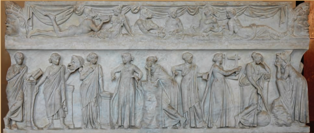
The nine Greek muses decorate the sides of a sarcophagus found in excavations of an ancient site near Rome. The muses are (left to right): Calliope, Thalia, Terpsichore, Euterpe, Polyhymnia, Clio, Erato, Urania, and Melpomene. The ancient coffin is now in the Louvre in Paris.

The Muses sang and danced, led by the god APOLLO, at celebrations given by the gods and heroes. They were the personifications of the highest aspirations and intellectual minds and represented a remarkable and attractive conception in Greek mythology. Their separation into fields of inspiration was a Roman fancy of a later date. The word museum denotes a place of education and research, named after them.