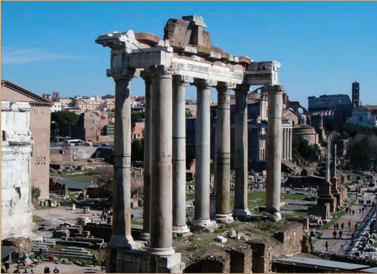
Ruins of an ancient temple to Saturn (foreground) remain today in the Roman Forum, which stood between the Capitoline and Palatine hills.

Rome became a world power in the third and second centuries B.C., expanding its rule to North Africa, Spain, and the eastern Mediterranean. Rome's conquests included Greece. In the Macedonian Wars of the third century B.C., Roman armies defeated the ruler of the northern portion of the Greek peninsula and then took over rule of the southern portion, home to the great Greek myths and the philosophical and cultural center of that part of the world.