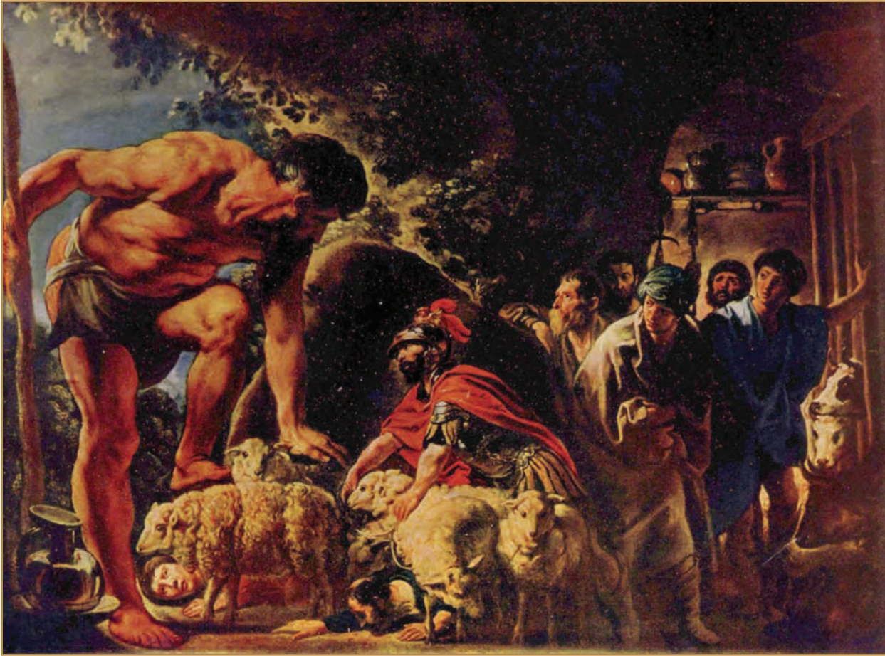
Odysseus (helmet) and his men are discovered by the giant cyclops Polyphemus who is driving his sheep into his cave for the night. Flemish artist Jacob Jordaens (1593-1678) captured the moment in this painting, which now hangs in the Pushkin Museum of Fine Arts in Moscow.

he moved the rock to let out the sheep to their pasture. He never suspected that Odysseus's men were leaving at the same time. It was not until the men were safe aboard their ship that they learned that POLYPHEMUS was the name of the monster. Polyphemus hurled rocks after the ship and vowed that his protector, POSEIDON, the sea god, would avenge him, and that the sea would always be Odysseus's enemy.