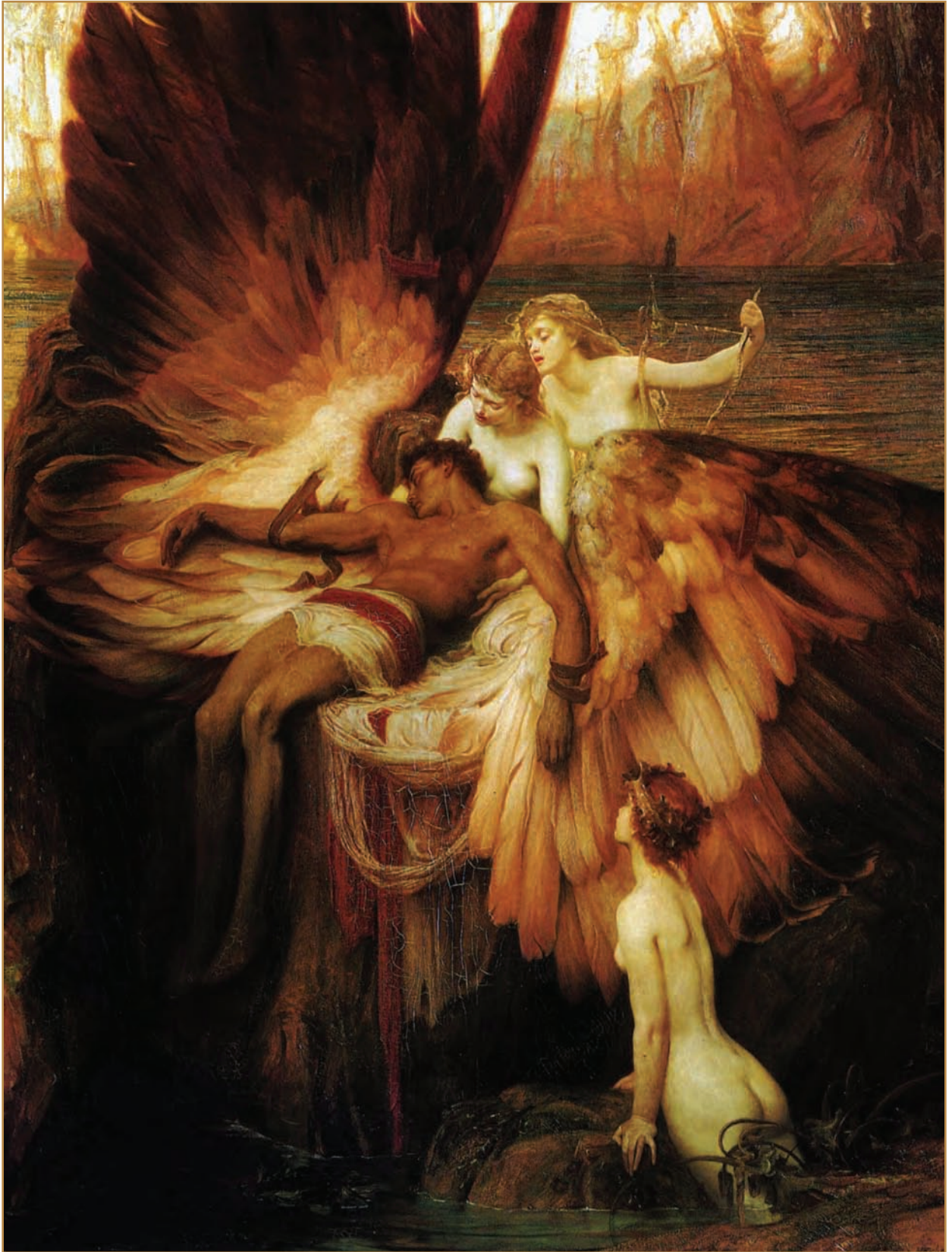
Nymphs mourn over the fallen body of Icarus, whose great wings melted when he flew too close to the sun. British artist Herbert James Draper (1863-1920) created this Lament for Icarus , an award-winning painting, in 1898. It hangs in the Tate Britain in London.