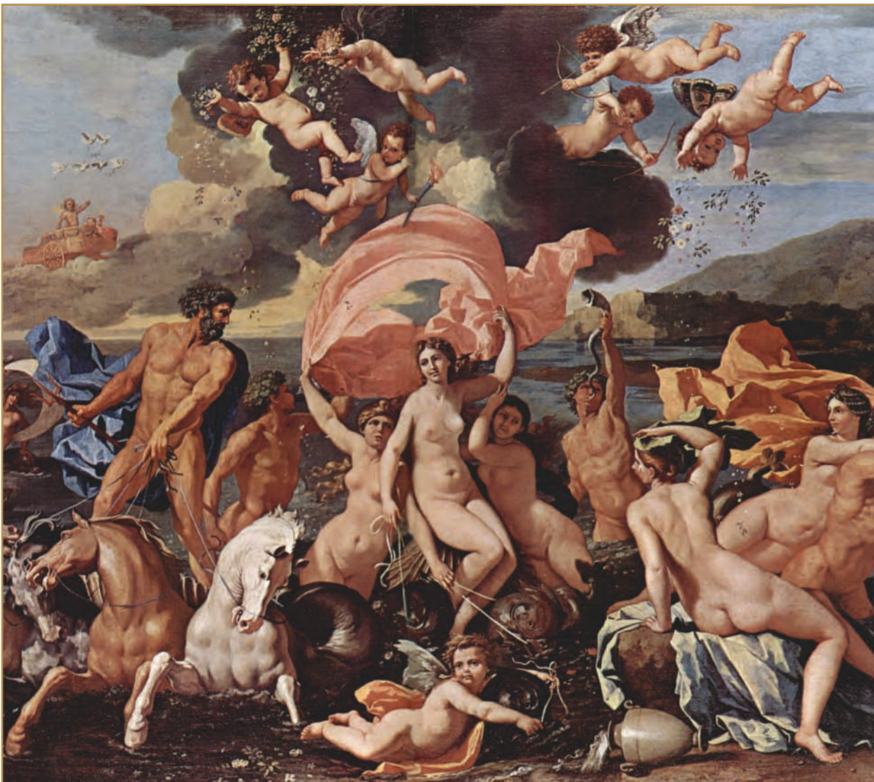
Neptune rides four horses on the left of this grand mythological painting by French artist Nicholas Poussin (1594-1665). Art experts debate whether the woman in the middle is supposed to be Venus or Galatea. The painting is in the Philadelphia Museum of Art.

NERIO ( NERINE ; NERIENE ; NERIENIS ; Valor) Roman A traditional and legendary wife of the war god MARS . She personified valor and bravery in life and in war. Nerio's name seems to come from the SABINES ,