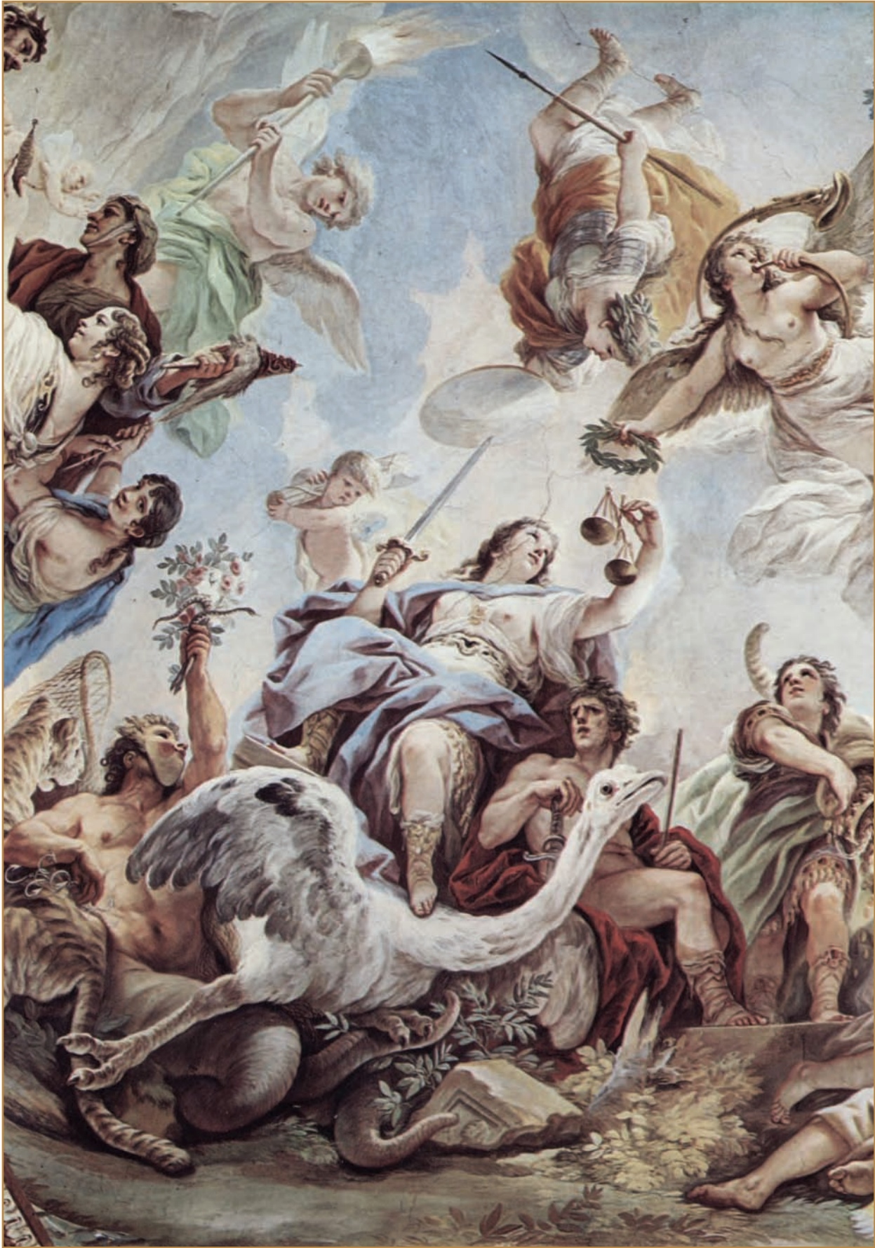
In this portion of a huge mural painted by Luca Giordano (1634-1795) in the Palazzo Medici Riccardi in Florence, Italy, the Roman goddess Justitia (with scales) reaches toward the heavens.