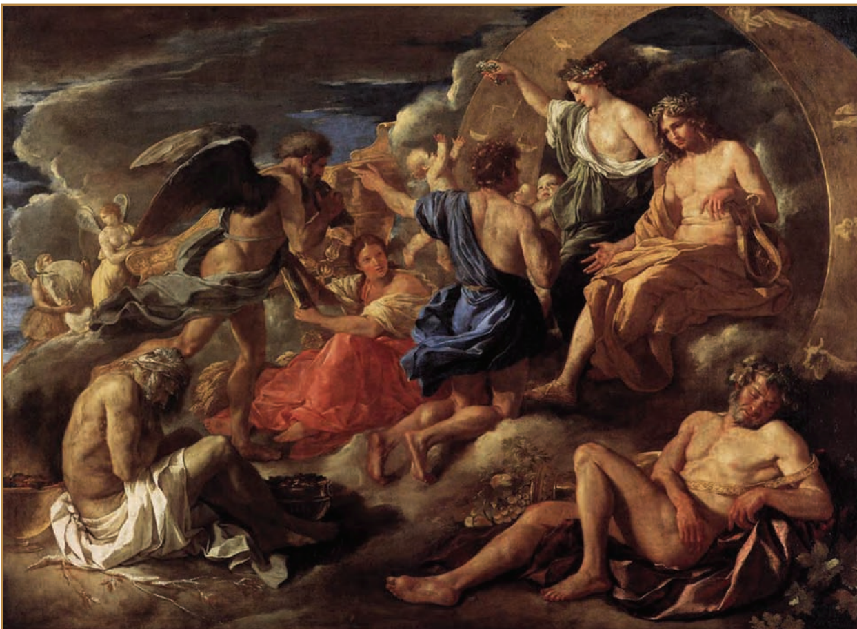
Phaeton (in blue) asks his father Helios, god of the Sun, if he may drive the Sun's chariot across the sky. Saturn (wings) is in attendance, as are the four seasons. Nicolas Poussin (1594-1665) painted this scene. It is now in the National Museum of Berlin.

PHAETON Greek Son of HELIOS , the sun god, and the NYMPH CLYMENE . The companions of Pha-