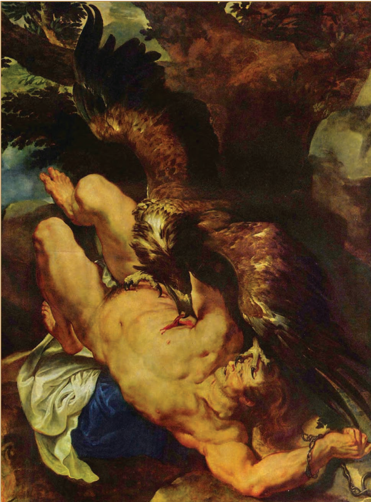
The god Prometheus, chained to a rock by Zeus for giving fire to humans, suffers each day as an eagle plucks at his liver. Flemish artist Peter Paul Rubens (1577-1640) portrayed the scene in this oil painting which now hangs in the Philadelphia Museum of Art.