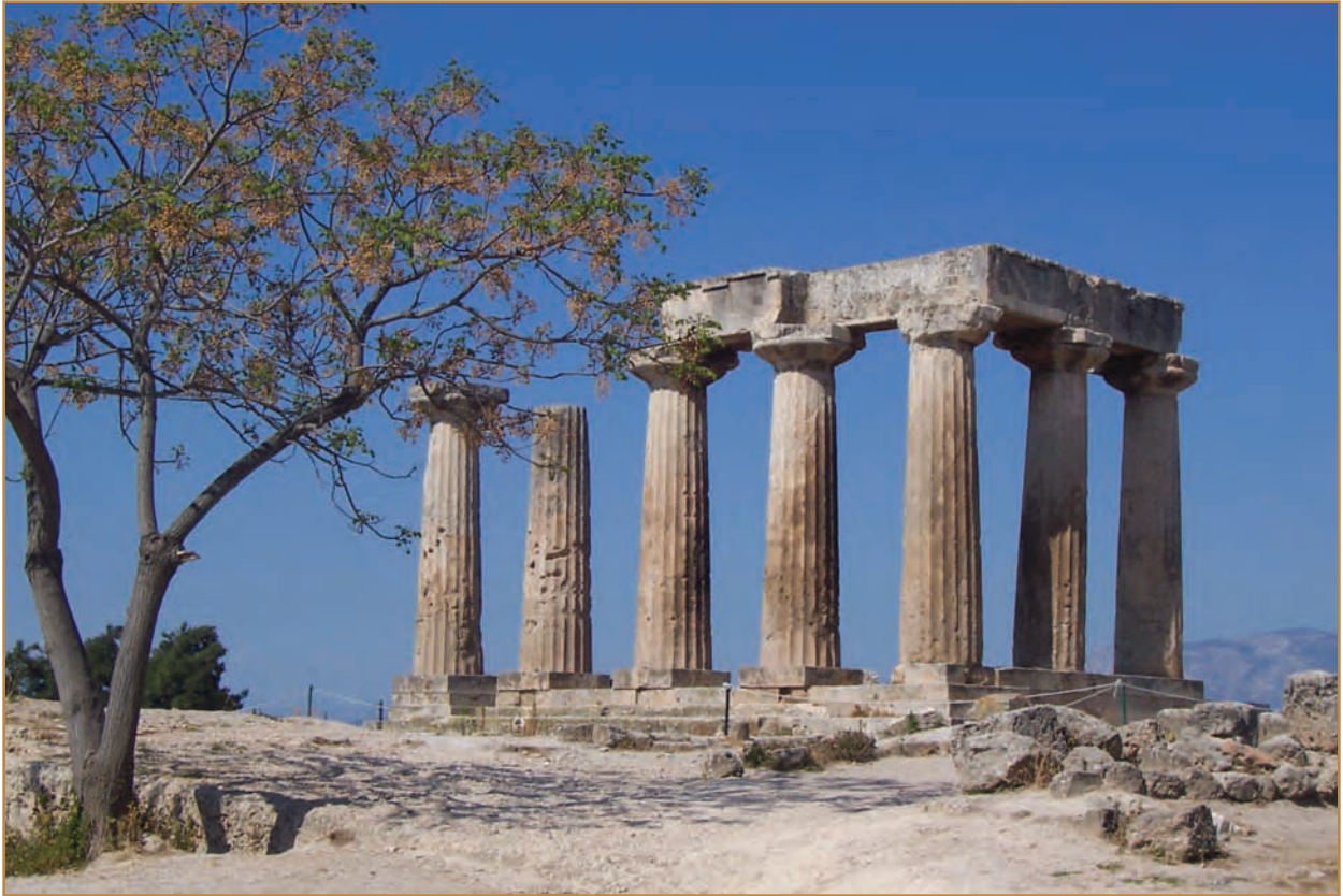
A corner of the Temple of Apollo in Corinth, Greece, probably built in the sixth century B.C., still stands on a hill-top. It is now a prominent tourist attraction.

stadium with seating for 150,000 people. Here Rome held very popular horse races. Another temple to Consus stood between the Palatine and the Aventine hills.