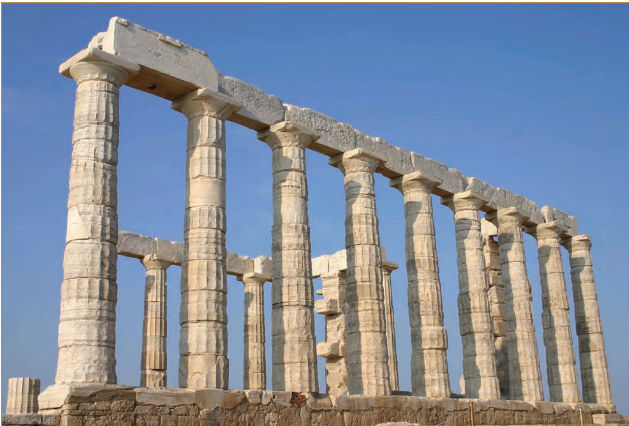
The ruins of the temple to Poseidon, built around 440 B.C., still stand overlooking the sea on the Cape of Sounion, 67 kilometers (about 42 miles) south-southeast of Athens.

Poseidon and Horses Poseidon created the horse, according to some ancient writers, with a blow of his trident. He also invented the bridle, which