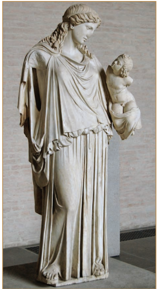
The Greek goddess of peace, Eirene, holds the infant Plutus, god of wealth, in this Roman copy of a Greek statue sculpted by Kephisodotos about 370 B.C. The statue is in the Glyptothek in Munich, Germany.

EIRENE (IRENE; Peace) Greek Goddess of peace. Eirene was the daughter of ZEUS and THEMIS, a TITAN goddess. According to the Greek poet HESIOD, she was one of the HORAE, goddesses of the seasons.