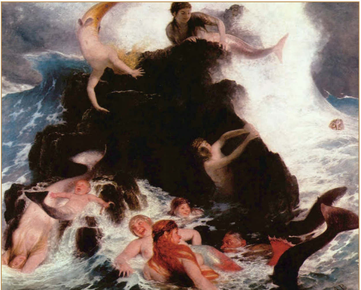
Naiads of all ages play among river rocks in this portrayal of the Greek water nymphs by Swiss painter Arnold Böcklin (1827-1901). He called the painting “Game of the Naiads” or “Naiads at Play” and gave his nymphs mermaids’ tails. It is in Kunstmuseum in Bonn, Germany.

Each Naiad presided over her own body of water and was worshiped for her ability to help and protect people with her water. The Naiads had the power of