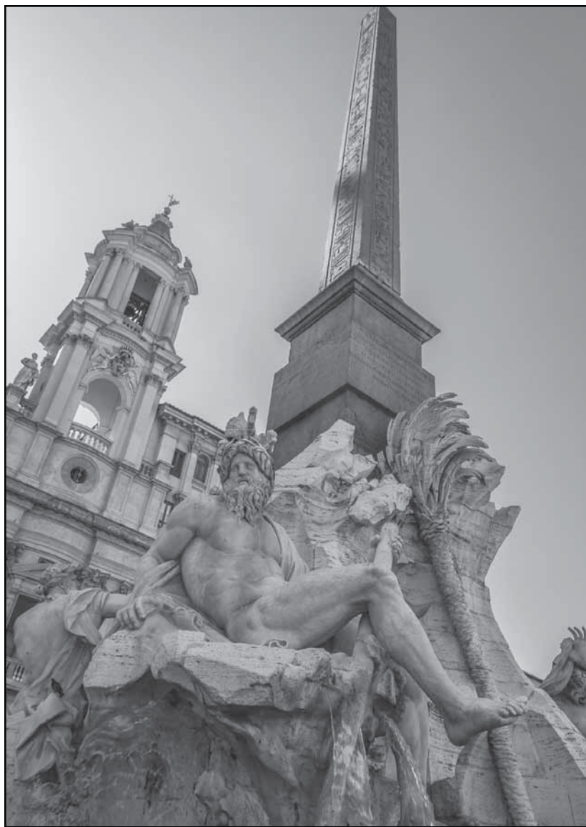
On top of the Fountain of the Four Rivers is the obelisk of Domitian, which once graced the central spine of the racecourse of Maxentius.