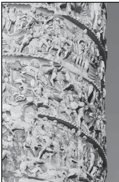
The column of Marcus Aurelius was clearly modeled on that of Trajan, with a spiral relief recording the victories of the emperor.