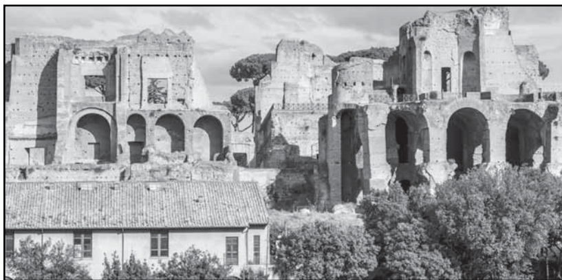
The House of Augustus is one of the most well-preserved ancient houses in Rome and a marvelous example of domestic patrician architecture.