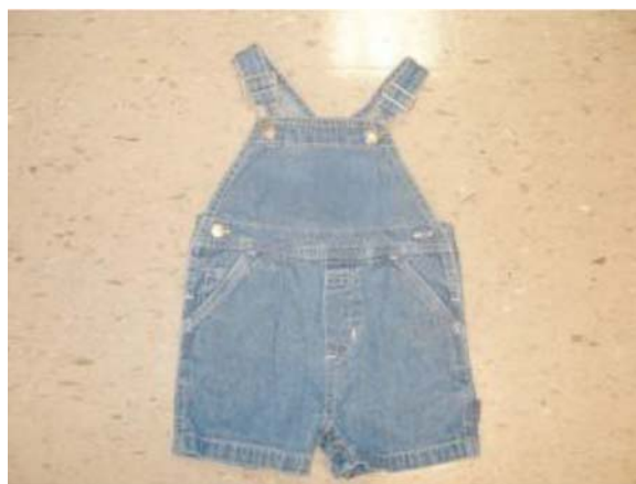
FIG. 3 Cutting: Side Pocket