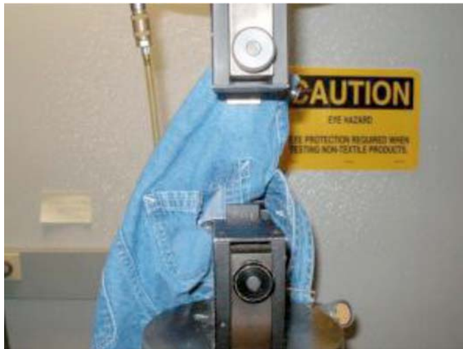
FIG. 5 Mounting: Patch Pocket