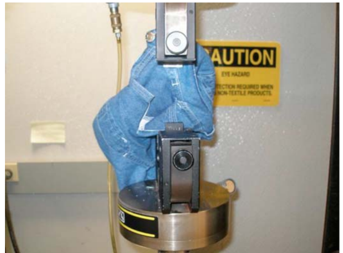
FIG. 7 Mounting: Side Pocket