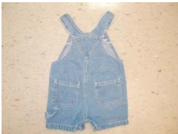
FIG. 1 Cutting: Patch Pocket

8.3.1 Verify the total operating system (loading, extension, clamping, and recording or data collection) by testing specimens of standard fabrics for breaking force and compare to the data with that given for the standard fabric. Prepare, test and compare the data given from the tested fabric to the given data known for the standard test.