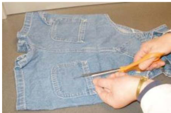
FIG. 2 Cutting: Patch Pocket