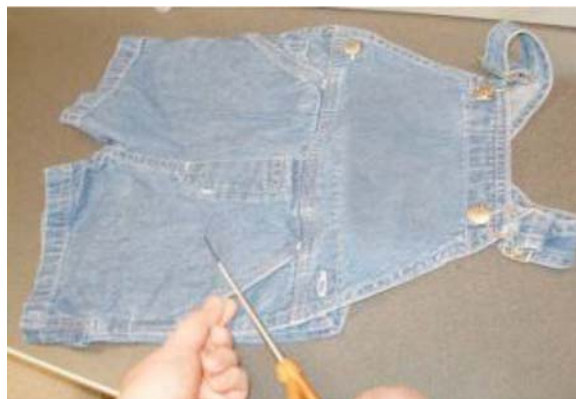
FIG. 4 Cutting: Side Pocket