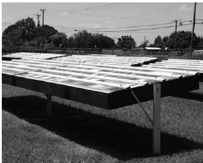
FIG. 1 Black Box in Use (from Practice G7 )

8.7.1 Measure the specular gloss in accordance with Test Method D523 .