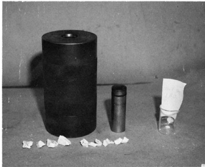
FIG. 2 Typical Unassembled Pressure Vessel and Samples