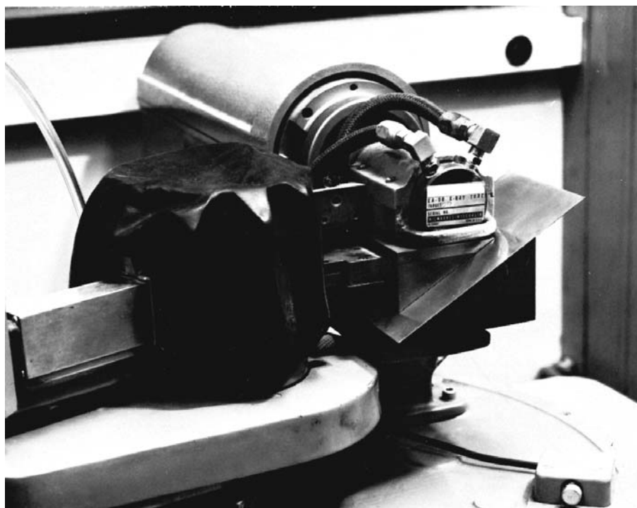
FIG. 1 Special Sample Holder for X-Ray Beam Exposure

9.2.2 Using an X-ray tube with suitable target, adjust the power supply to provide 50 kV at 25 mA and set the scaler for a 10-s count. Align the spectrogoniometer to 48.65°, 2-θ angle for nickel determination using a lithium fluoride crystal. Start the apparatus and record the count from the counter scales.