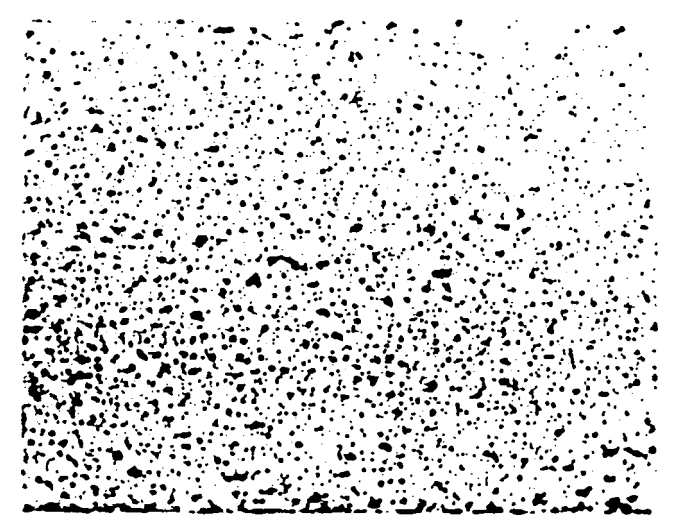
FIG. 1 Reboiling of Porcelain Enamel on Steel

ASTM International takes no position respecting the validity of any patent rights asserted in connection with any item mentioned in this standard. Users of this standard are expressly advised that determination of the validity of any such patent rights, and the risk of infringement of such rights, are entirely their own responsibility.