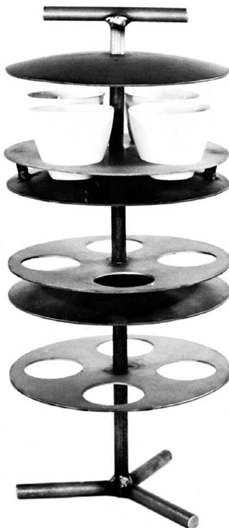
FIG. 1 Suitable Rack for Protecting Specimens from Drip or Condensate