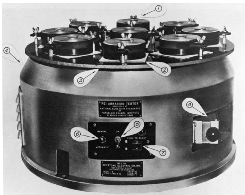
1. Rubber-lined retaining ring with accessory hole for introducing abrasive charge. 2. Test specimen. 3. Phenolic or aluminum top. 4. Aluminum housing. 5. ON-OFF switch. 6. Selector switch. 7. Circuit breaker button. 8. Automatic timer.